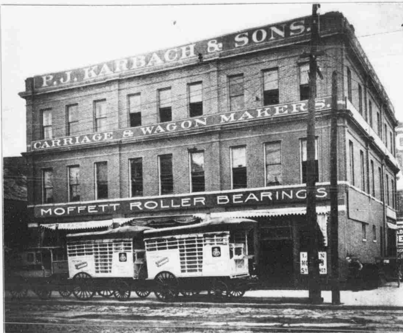
This cut is a representation of the building where 23 vehicles with MOFFETT ROLLER BEARING AXLES were built during the past season; where 437 sets of Rubber Tires were applied during the past season, besides an increase of nearly 140 per cent in our repair work. What does this mean? That we are today the foremost vehicle builders in this section of the country.