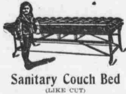
Sanitary Couch Bed

(LIKE CUT) Brass trimmed, brass rods and spindles, very elegant bed for the price. $7.50 value. 50 beds in this lot. Special price . . . . . 4.98