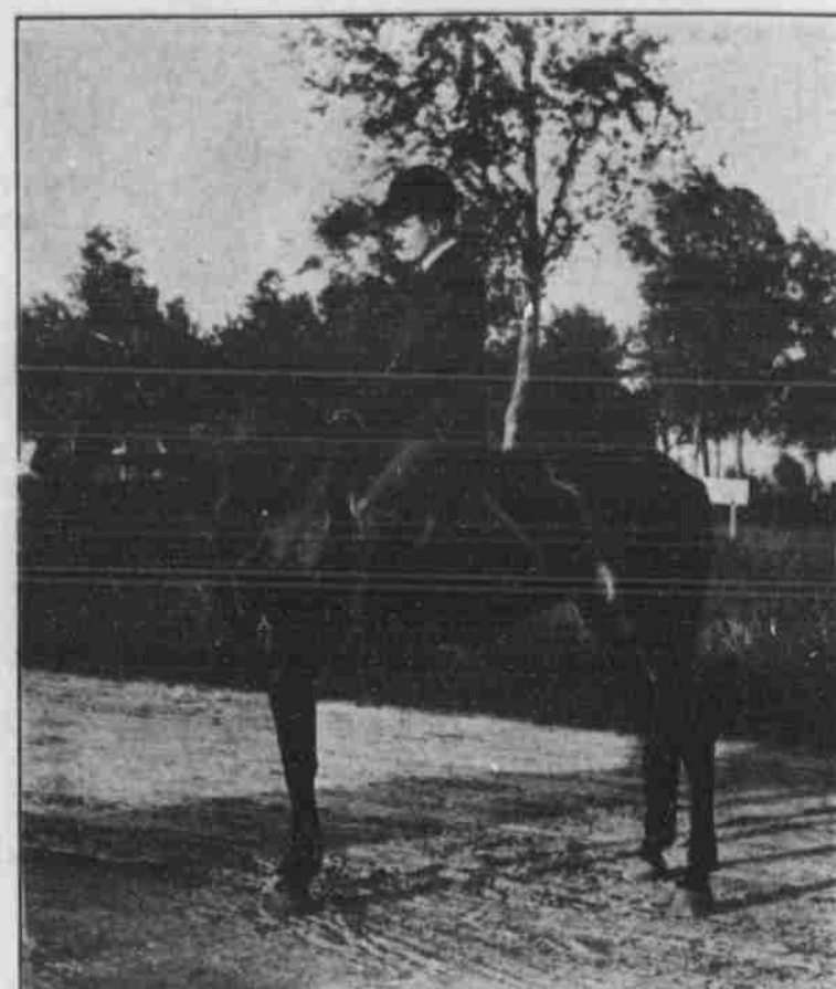
L. H. TATE—CORRECT RIDING POSITION.