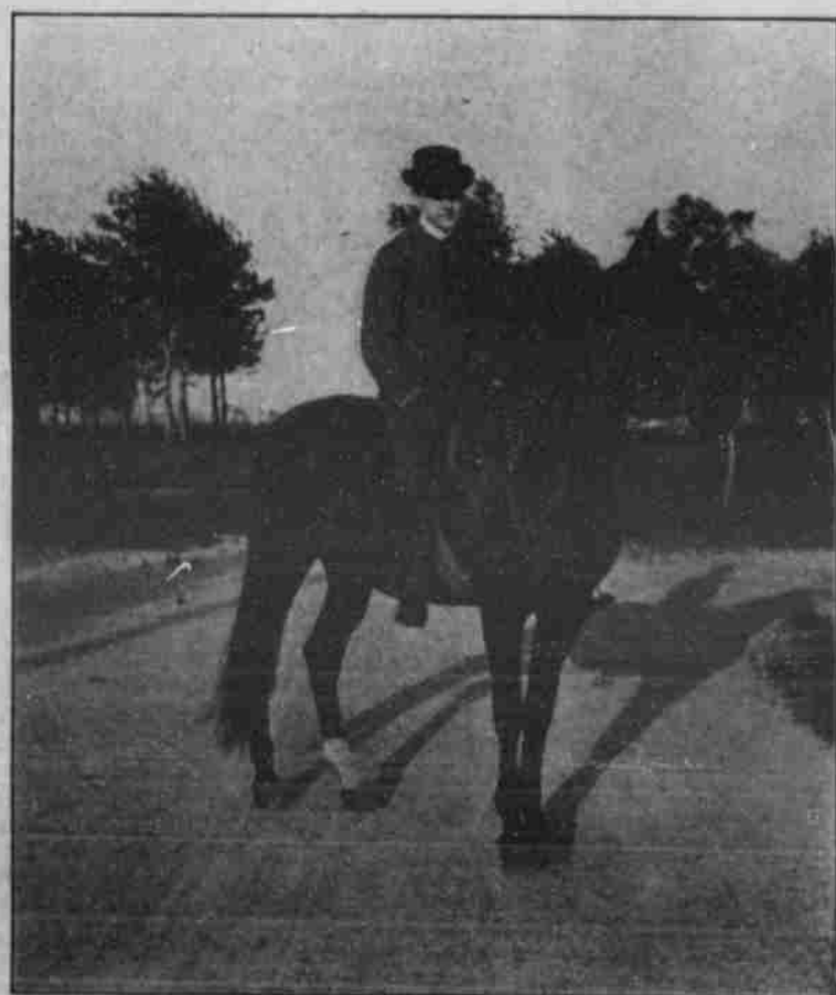
M. M. BLACK RIDES A BEAUTY.