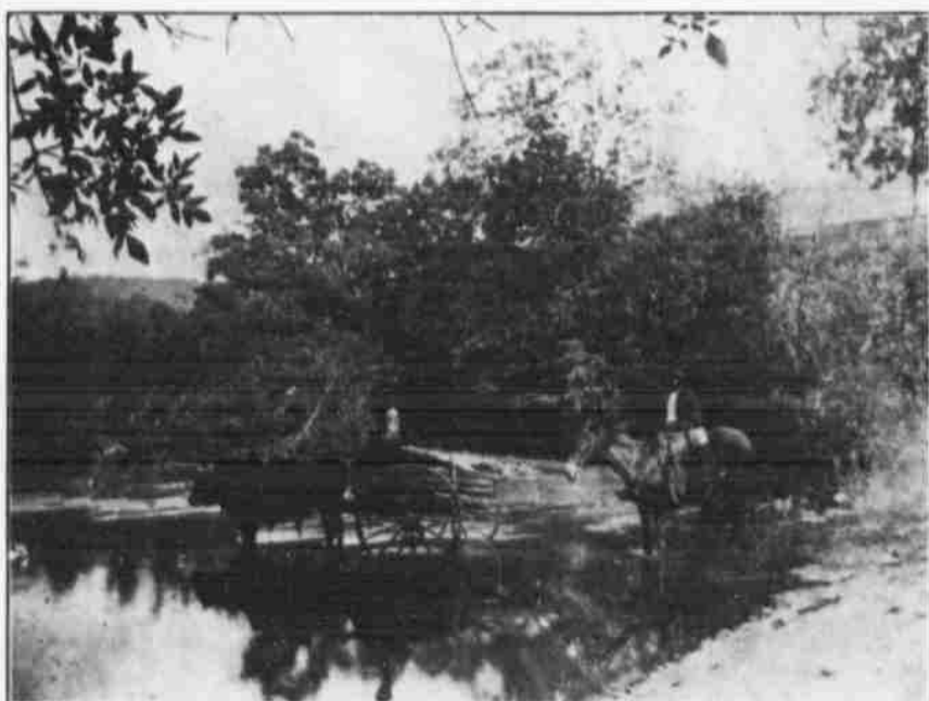
CROSSING OF MORRIS CREEK ON THE ROAD TO MONTICELLO.

Solitary confinement is the most severe of all punishments. This is proof positive that a man soon tires of his own company.