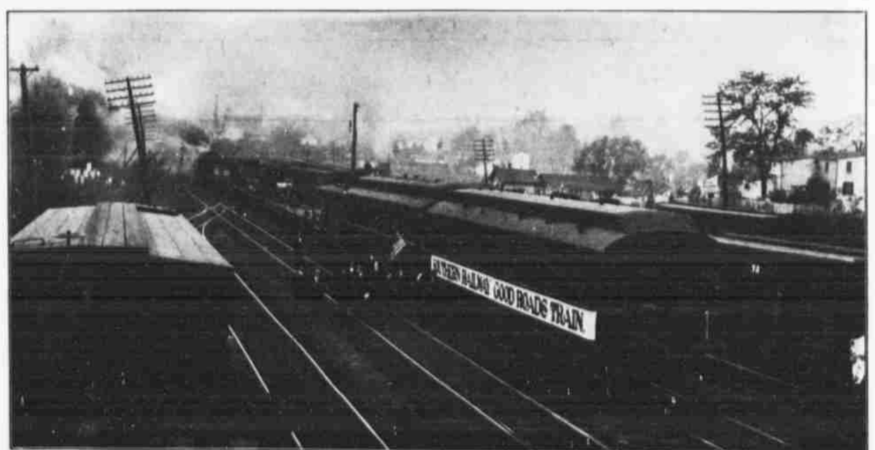
SOUTHERN RAILWAY GOOD ROADS TRAIN AT ALEXANDRIA, VA.