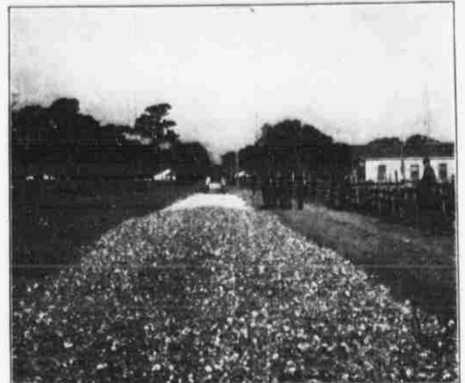
MAKING AN OYSTER SHELL ROAD AT MOBILE, Ala.

T HE Southern Railway Good Roads train, equipped with thirteen cars of modern road machinery, a commissary car, two officers' cars, left Alexandria, Va., Tuesday, October 29, 1921, for a tour of the southern states on the line of the Southern system, in the interest of common road improvement.