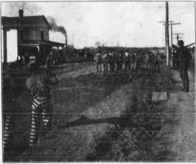
CONVICTS MAKING ROAD IN NORTH CAROLINA.