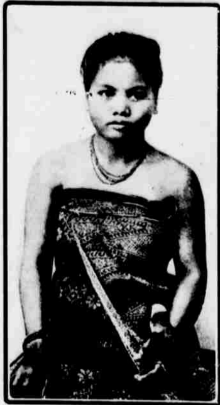
MAIDEN FROM INTERIOR JAVA.