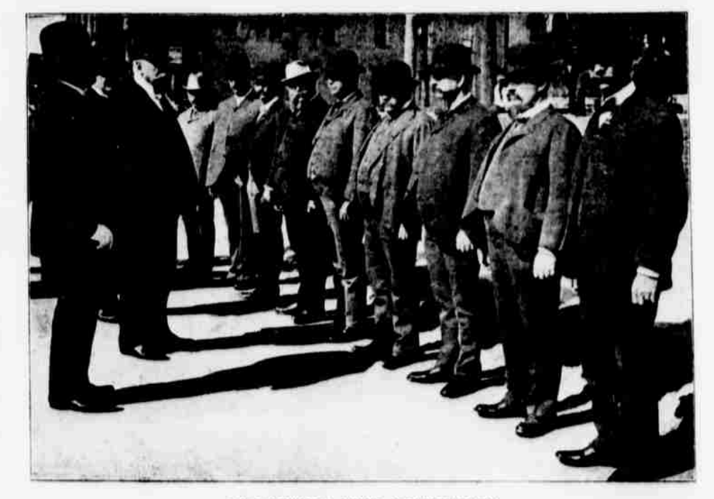
INSPECTING THE DETECTIVES