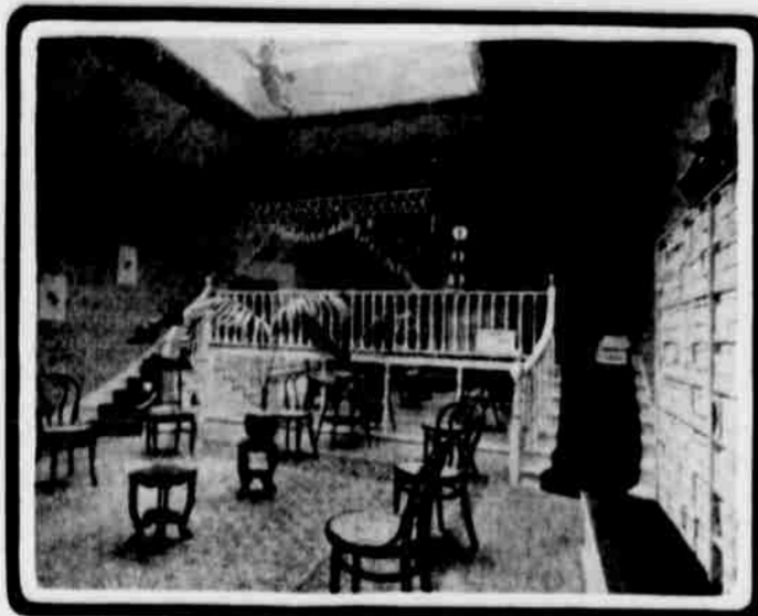
OFFICE AND MAIL ORDER DEPARTMENT ROCHESTER SHOE COMPANY, 1515 DOUGLAS STREET.

The Rochester Shoe company succeeded the Howe Shoe company September 1, 1900. Plans were laid at once to dispose of the stock on hand, the building leased for a term of years and contracts let to rebuild the interior of the store, the company believing that the progressiveness of Omaha and tributary territory would support an