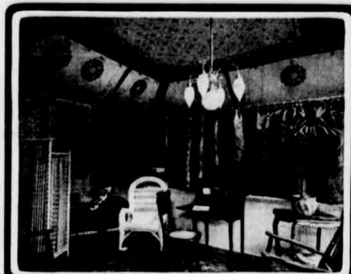
RECEPTION ROOM ROCHESTER SHOE COMPANY, 1515 DOUGLAS STREET.

turn the same within thirty days after date of purchase; the same will be exchanged or the money cheerfully refunded. The slightest provocation from salesman to customer is cause for direct dismissal.