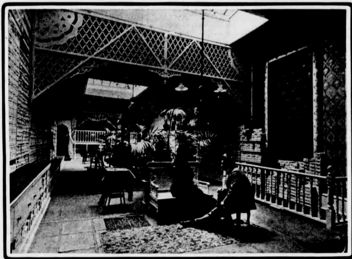
SCENE IN FITTING ROOM ROCHESTER SHOE COMPANY, 1515 DOUGLAS STREET.

The Rochester Shoe company, with the opening of Omaha's finest shoe store, has inaugurated a complete mail order department. Catalogues are mailed on application. All orders leave the same day as received. Correspondence answered promptly. For further particulars address the ROCHESTER SHOE CO., 1515 Douglas Street.