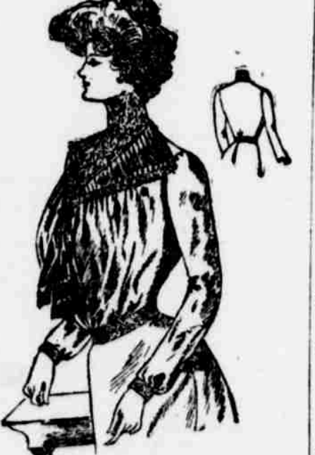
3785 Shirt Waist, 32 to 42 in. bust.