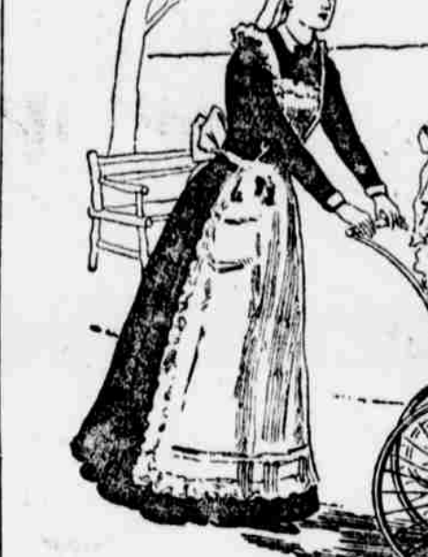
A PRETTY MORNING EQUIPAGE FOR THE PARK.

Frills of Fashion. The neat, natty and durable tailor strap-pings of past seasons will be still more in evidence on winter costumes.