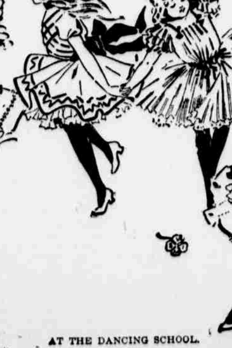
AT THE DANCING SCHOOL.

Remove the legs from the doll and sew firmly to the end of the body a little silk bag just large enough to hold the twine ball loosely. Then dress the doll in a big full skirt and two full capes. Fasten the capes at the neck with a long bow of ribbon.