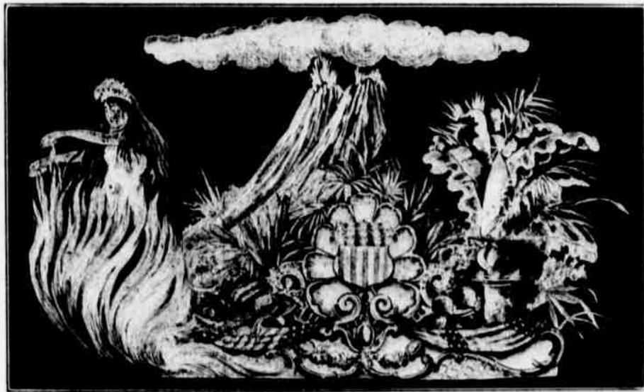
FLOAT NO. 18—"HAWAII."

Dear to every childish heart. Robinson Crusoe, in his traditional suit of skins, is here seen giving his faithful man, Friday, a bland homily on the "Consent of the governed."