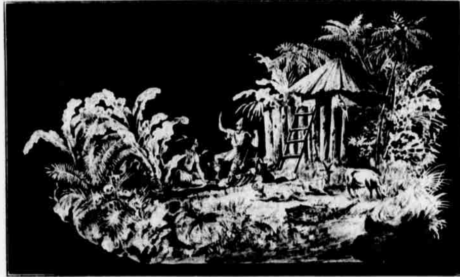
FLOAT NO. 17—"THE ISLAND OF ROBINSON CRUSOE."

The land of the ruddy grape. Surmounting the float is the god Bacchus; at the sides the tendrils and leaves of the vine, ornamented with the arms of Portugal.