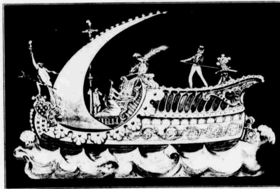
FLOAT NO. 8—"CUBA."

The lonely crag in the stormy Atlantic, under the sorrowful gaze of the captive Napoleon. In the foreground the English lion. Under his outstretched paws the grim relics of war and the ruins of empire.