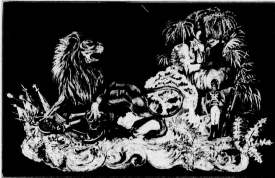
FLOAT NO. 7—"ST. HELENA."

"The Emerald Isle," unique in the world's history. Our future political leaders are seen making merry at the foot of Tara's harp surrounded by the shamrock, beneath the ruins of Blarney castle, while at the sides the venerable St. Patrick drives forth the last of the snakes.