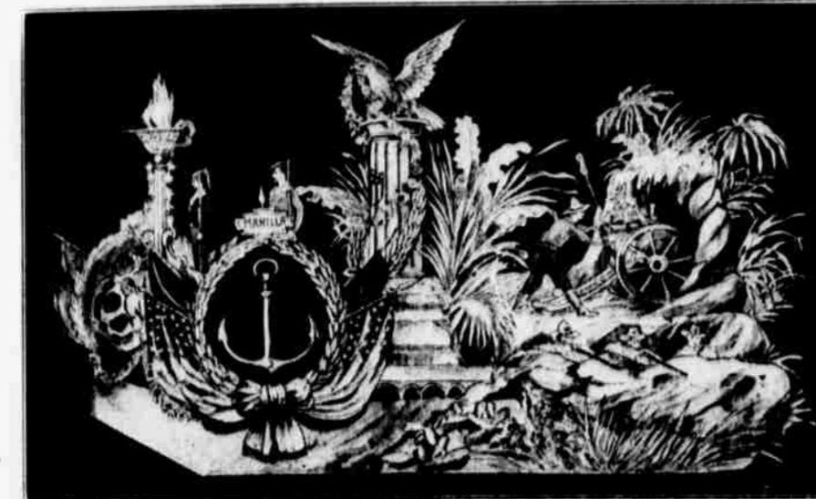
FLOAT NO. 9—"THE PHILIPPINES."

"The Gem of the Antilles." Her ship of state, now in more peaceful waters, is seen with "Uncle Sam" at the helm, the God of Commerce at the prow, while fair "Cuba Libre" reclines at the feet of Columbia, with little Porto Rico looking timidly and wistfully on.