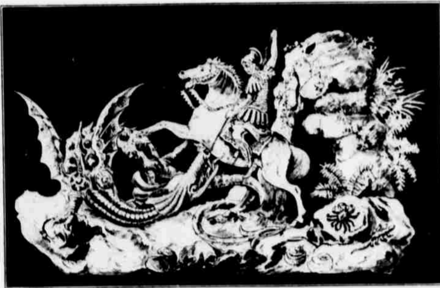
FLOAT NO. 4—"ENGLAND." "The Mistress of the Seas," upon whose flag the sun shines ever. Depicted by the tableau of "St. George and the Dragon."