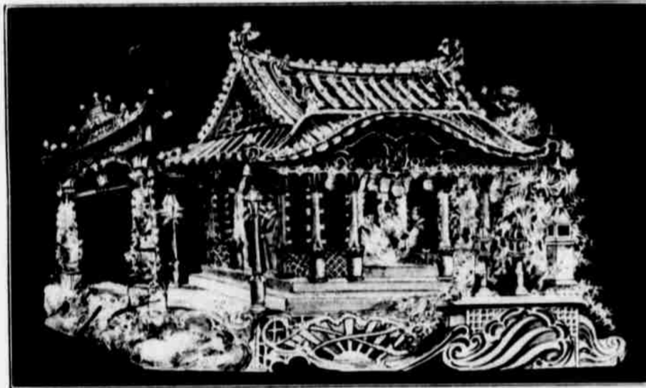
FLOAT NO. 3—"JAPAN." The quaint kingdom that woke so suddenly from the sleep of ages. Here are shown the tea garden, the cherry blossoms, the chrysanthemums and the dainty people.