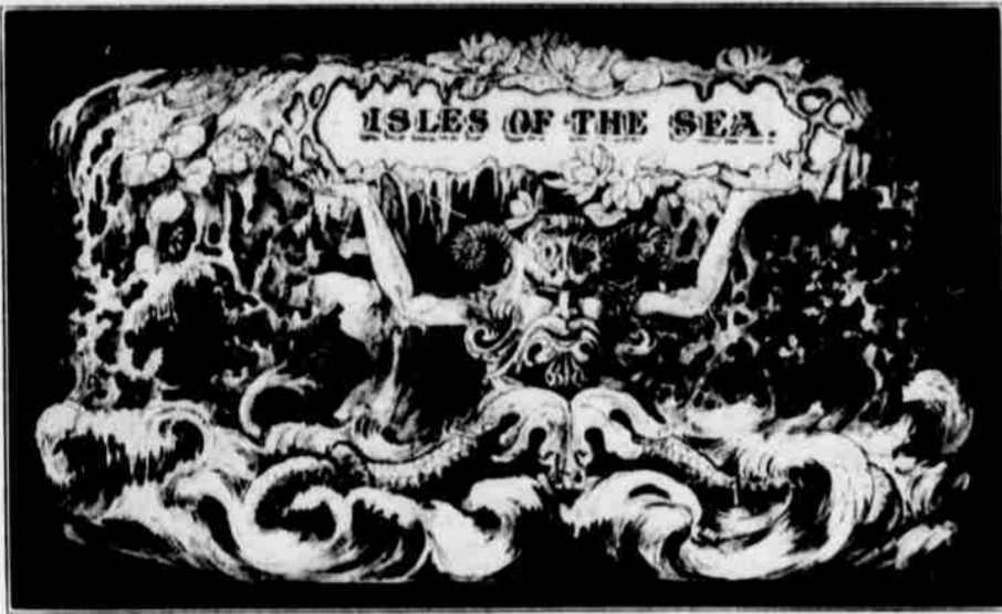
FLOAT NO. 2—"THE TITLE FLOAT." On the broad Pacific, the stormy Atlantic, beneath the Southern Cross and in the Vast White North rest the "Isles of the Sea."