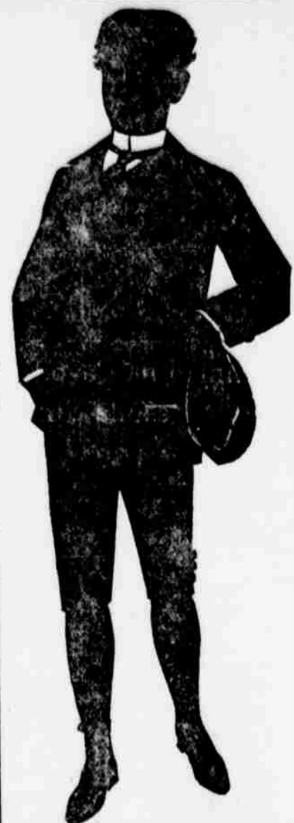
$7.50 and $8.50 Finest Fancy Vest Boys' Suits $3.50

Others simply can't, that's all there is to it. We bought these goods for so little money we can make almost any price