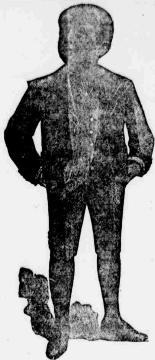
Boys' and Youths' Long Pants Suits.

The $7.50 and $8.50 boys' long pants suits in finest blue serges, fast dye; black all-wool clay worsteds, striped and checked all wool cassimeres, fancy and plain cheviots, brand new spring styles, worth and sold up to $8.50 and $9.50; for this sale they go at