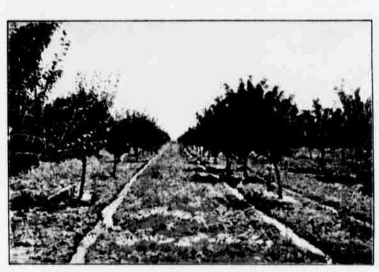
Irrigation and Fruit Culture on the Union Pacific, South Platte Valley.