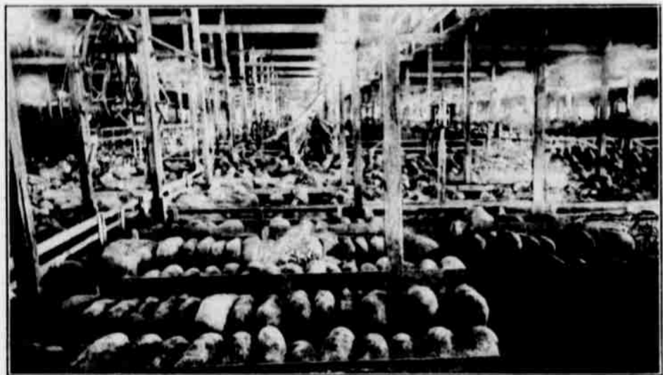
FEEDING SHEEP IN THE GREAT BARN.

Papa (after the company has gone)—Dorothy, why did you not obey me when I spoke to you? Dorothy—Oh! papa, I hated to before all those people