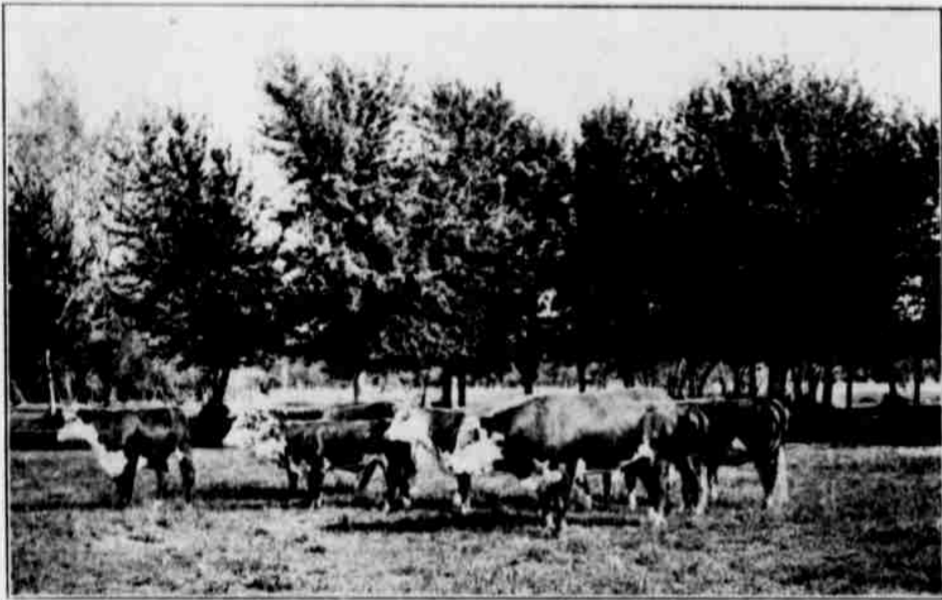
YOUNG HEREFORD CATTLE—THOROUGH BREDS.

scale, 500 acres being planted for the first crop. His experiments were so successful that a company was soon organized to build a sugar factory and the splendid new plant at Ames is the tangible result of his untiring efforts. The Standard Cattle company has been a boon to the farmers of Dodge