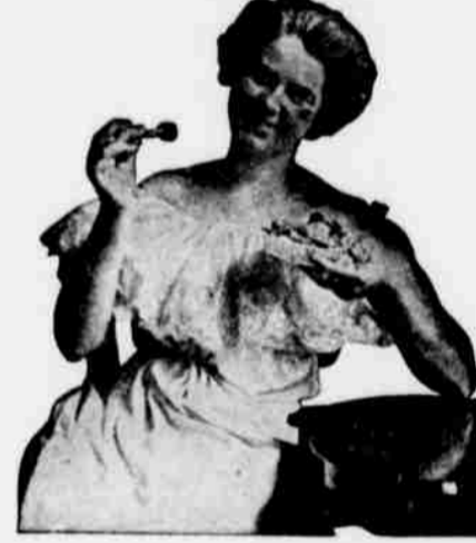
All the Ladies Eat

THE REGENT SHOE CO. 205 South 15th St., Omaha. Write for Illustrated Catalogue—free.