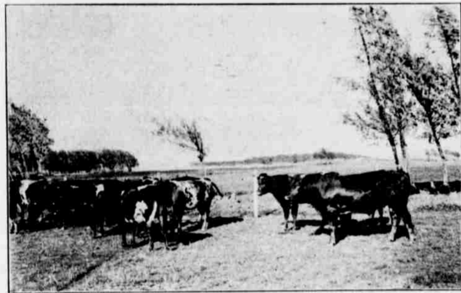
BUNCH OF HIGH GRADE DURHAMS.