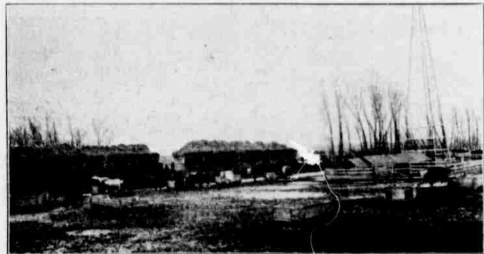
CORNER IN FEED LOTS AT AMES.

"A Perfect Food" "Preserves Health" "Prolongs Life"