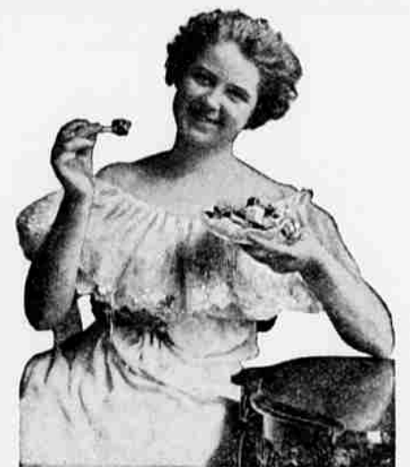
All the Ladies Ent