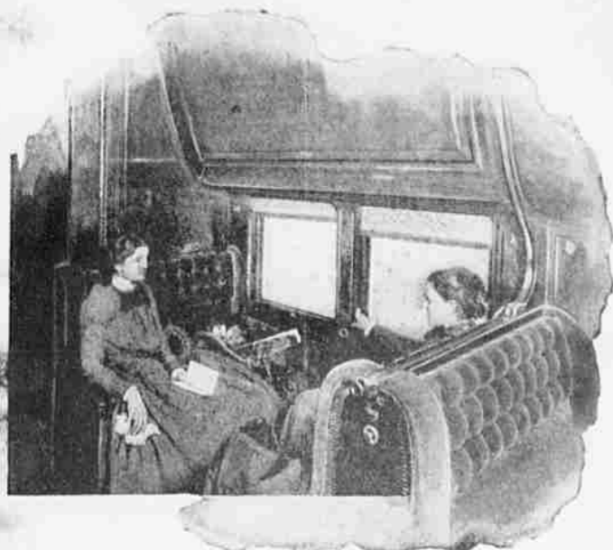
COZY CORNER IN PALACE SLEEPER ON UNION PACIFIC.

FROM OMAHA, 11:55 P. M. "The Colorado Special" FOR DENVER AND COLORADO POINTS.