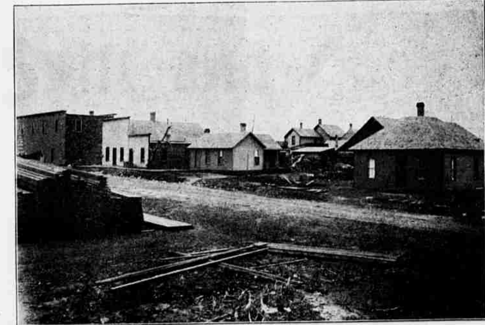
THE NEW HERMAN—IN THE PATH OF THE TORNADO.

for a year, but I hope to see you oftener than that." "Thank you. You are very kind. You will not take it amiss, however, if I say it's doubtful?" "Sorry to hear that. I hope there was nothing in the sermon to offend you?" "Oh, I never take offense at anything. It isn't worth while. Still, I have some rather positive ideas about things. I don't suppose, now, that you have the least idea your opening prayer was fifteen minutes long?" "You astonish me. Was it?" "Fifteen minutes, by the watch." "That is too bad. If it occurred to you to hold a watch on me I dare say you didn't join with much heartiness in the exercise, and so far as you are concerned I may consider that prayer wholly wasted." "I hope not. I learned a lesson in patience, and I didn't yawn, as the brother sitting next to me did." "You were not so absorbed in devotion, then, as to prevent you from noticing the brother yawning?" "Well, I shouldn't have noticed it if he had not made such an effort to suppress it. But he couldn't. It had to come. You can't expect an audience to maintain a devotional strain for a whole quarter of an hour. It's different, of course, with the minister. After he has fairly begun, and the fervor of extemporaneous oratory comes upon him, he