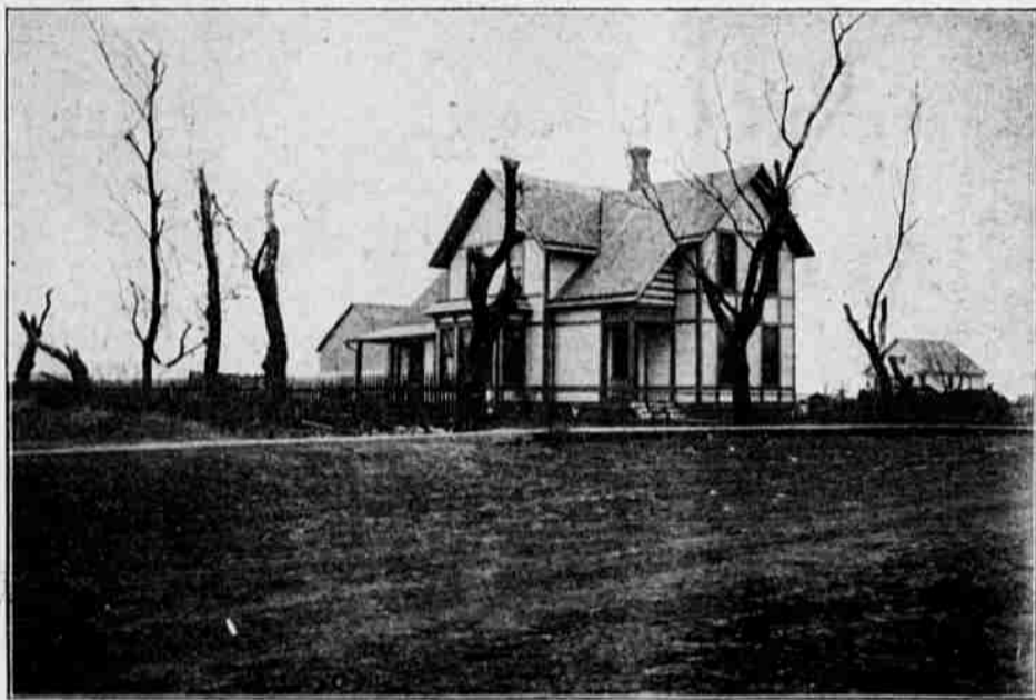
THE NEW HERMAN—NEW RESIDENCE—OLD TREES.

tial business houses and comfortable dwellings. Hardly a scar remains as a reminder of the terrible calamity which came at the close of that June day. A newness and a lack of shade trees gives the air of a western boom town, which had sprung up in the night. Here the similarity ends. It has none of the free and easy hilarity and vices of the boom town. These are the homes and places of business of a sturdy people who have had the courage to rise superior to disaster, and here law and order reigns supreme. They were not even willing to forego the water works, which had been