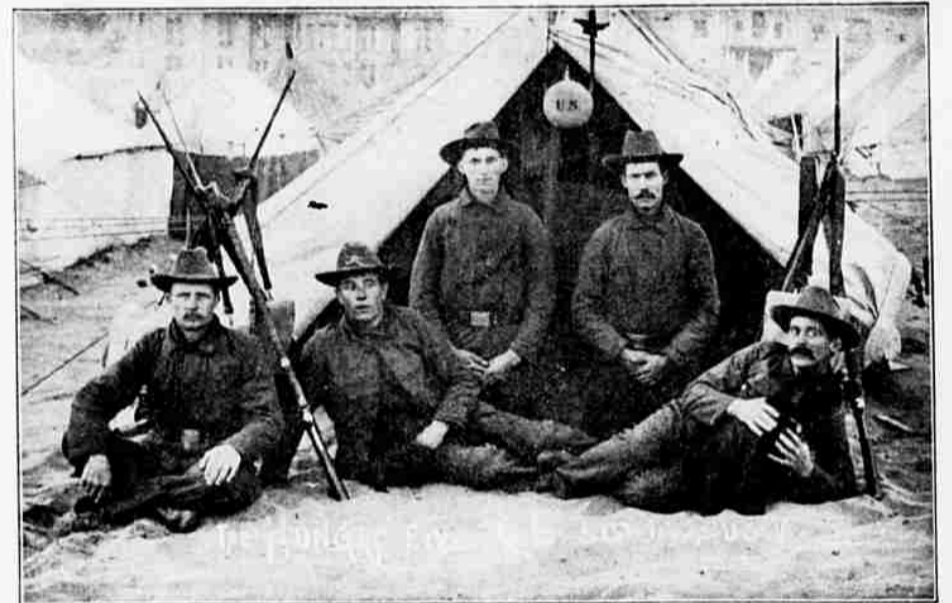
THE HUNGRY FIVE OF COMPANY L.