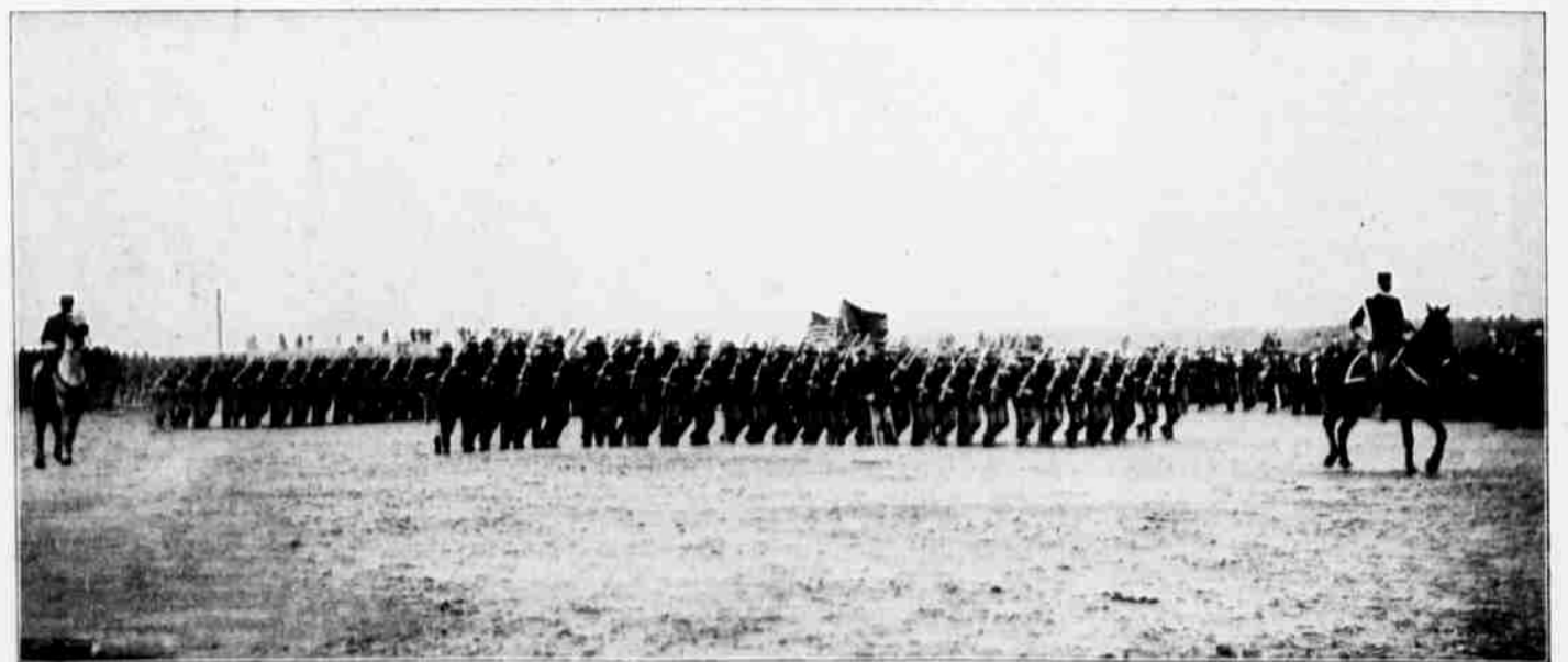
FIFTY-FIRST IOWA VOLUNTEERS PASSING IN REVIEW BEFORE GENERAL MERRIAM.