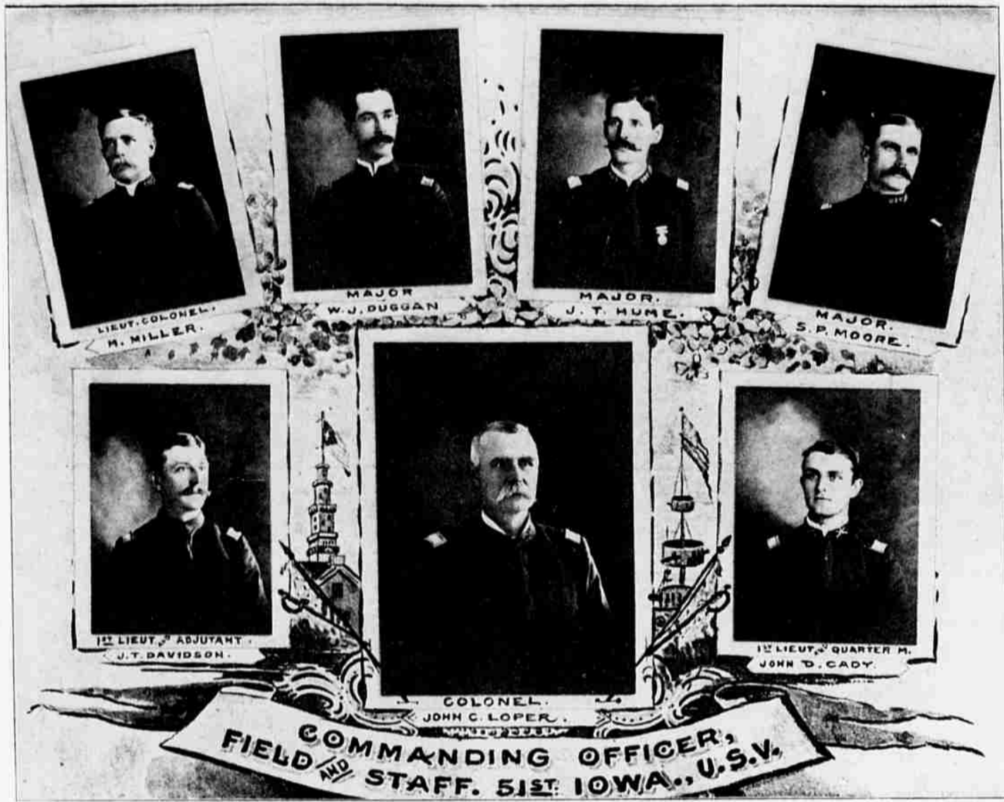
PRINCIPAL OFFICERS OF THE FIFTY-FIRST IOWA VOLUNTEERS.