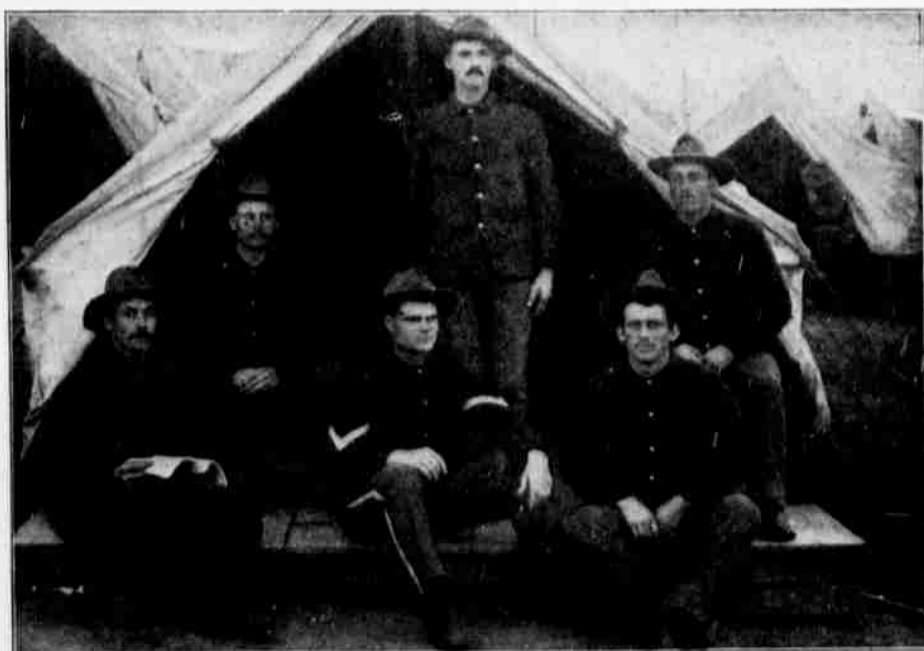
A CAMP GROUP AT THE PRESIDIO.