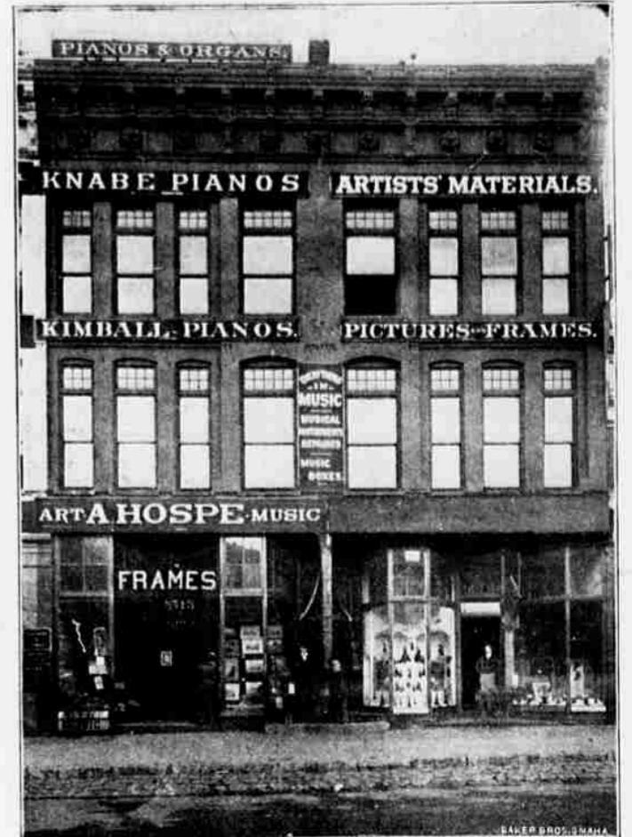
A. Hospe's Music and Art Emporium, 1513-1515 Douglas.