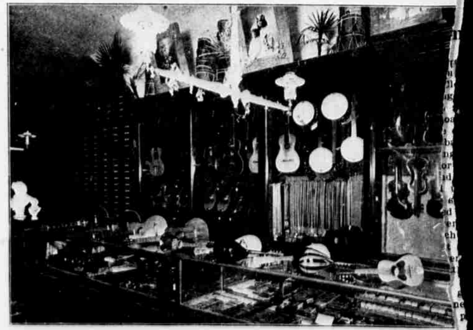
A. Hospe's Retail Musical Department