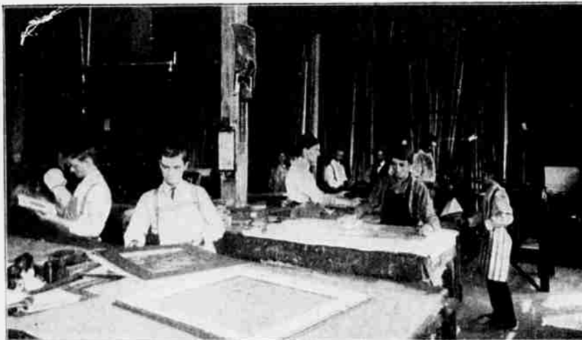
A. Hospe's Fitting Department—Factory.

The organ room in the basement contains over fifty instruments