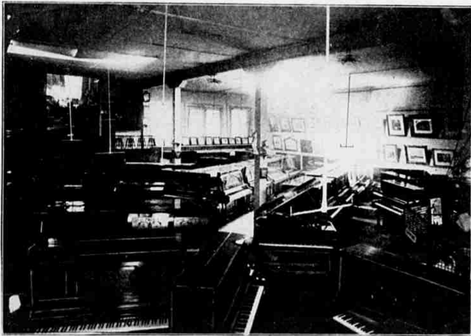
A. Hospe's Piano Room.

The fact of an institution's growth is the strongest argument and highest evidence of its merit—a compliment far superior to all praise composed merely of words, and this fact cannot be more emphatically impressed