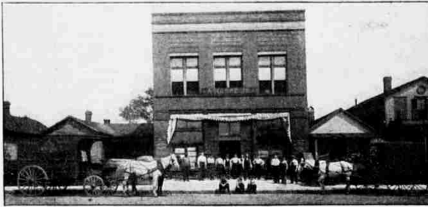
A. Hospe's Picture Frame Factory, 1614 Izard Street.