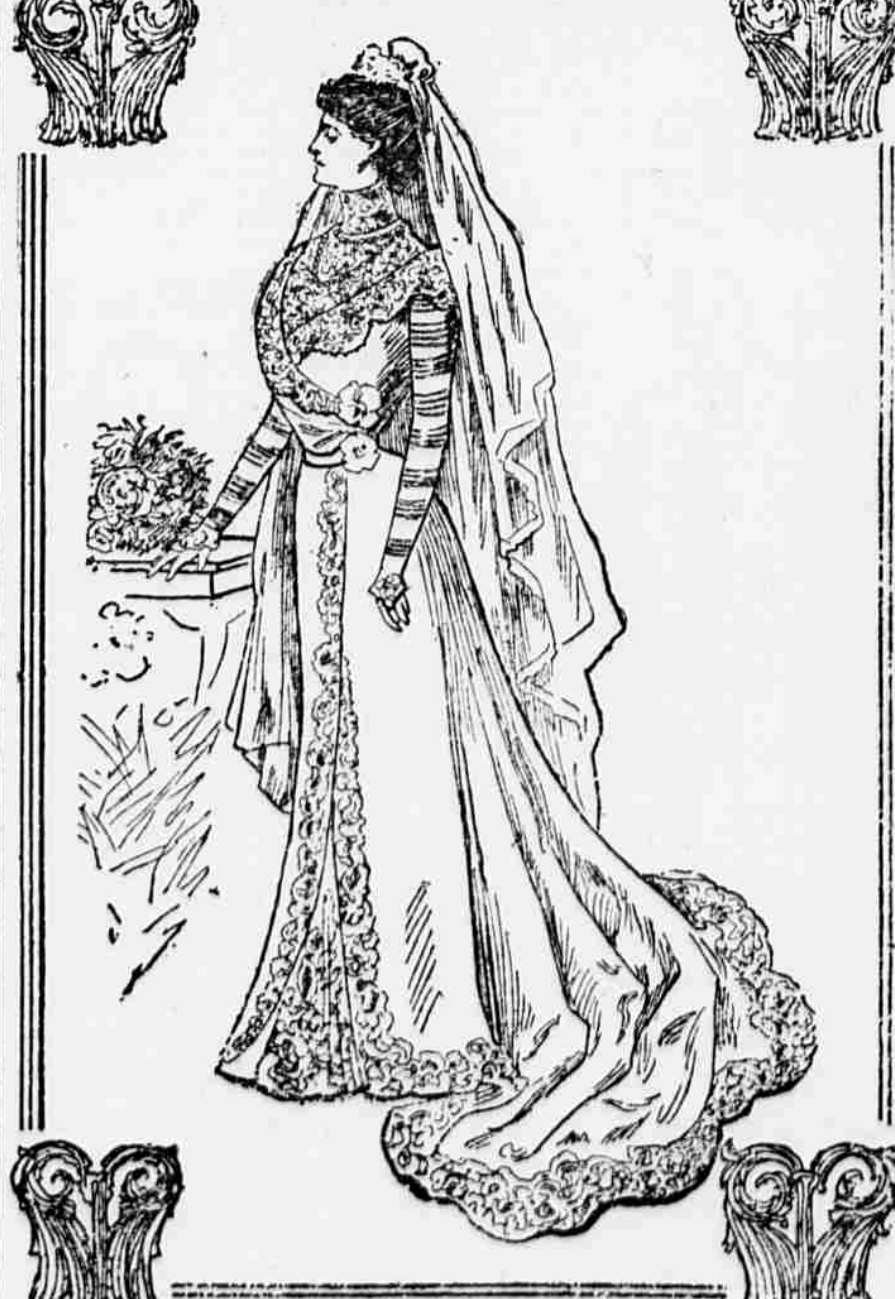
WHITE TAFFETA WHODING GOWN FROM HARPER'S BAZAR The wedding gown seen upon this page, and of which a cut-paper pattern is

n the latter place being in Spanish. And he ejaculated Oh! C