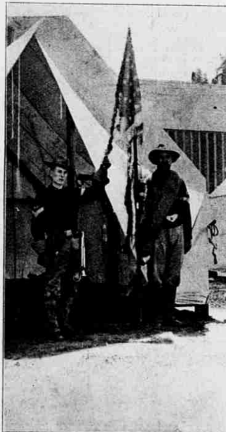
COLOR SERGEANT AND CHIEF BUGLER.