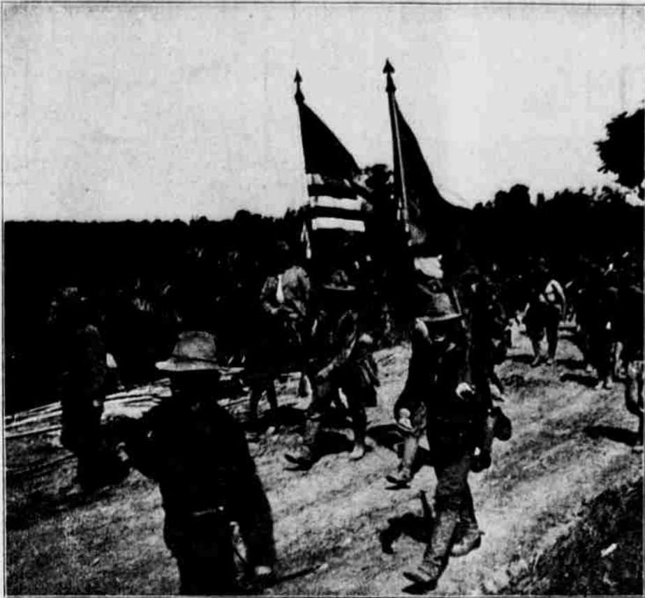
MARCHING IN FROM SAN FERNANDO.