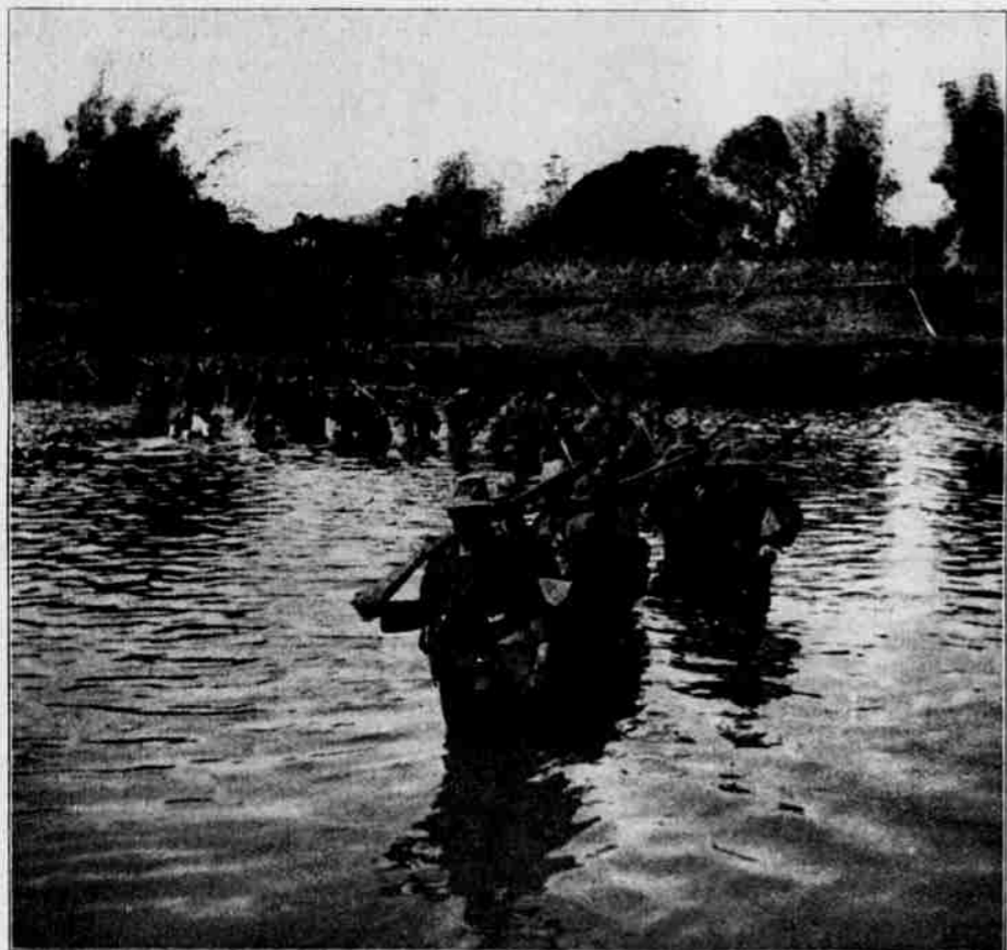
CROSSING THE RIVER ON THE WAY TO MALOLOS.