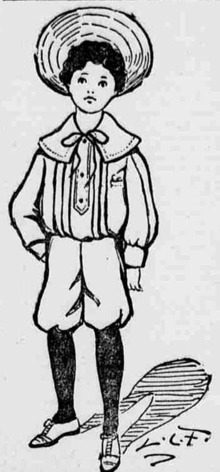
A GAY LITTLE SERGE SUIT.

'The arrival off the southern coast of the advance ships of the American fleet was the cause of much excitment among the colors of Castile. There was a tremendous Spaniards, especially those holding office