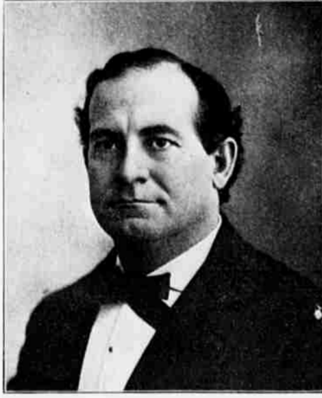
WILLIAM J. BRYAN.