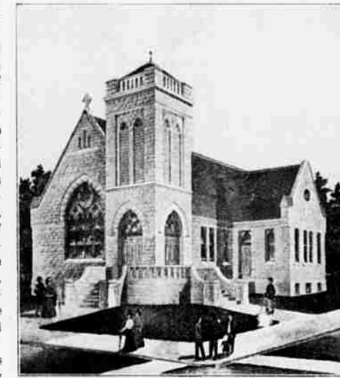
ST. MARTIN'S EPISCOPAL CHURCH, SOUTH OMAHA.

A committee was selected, consisting, be-