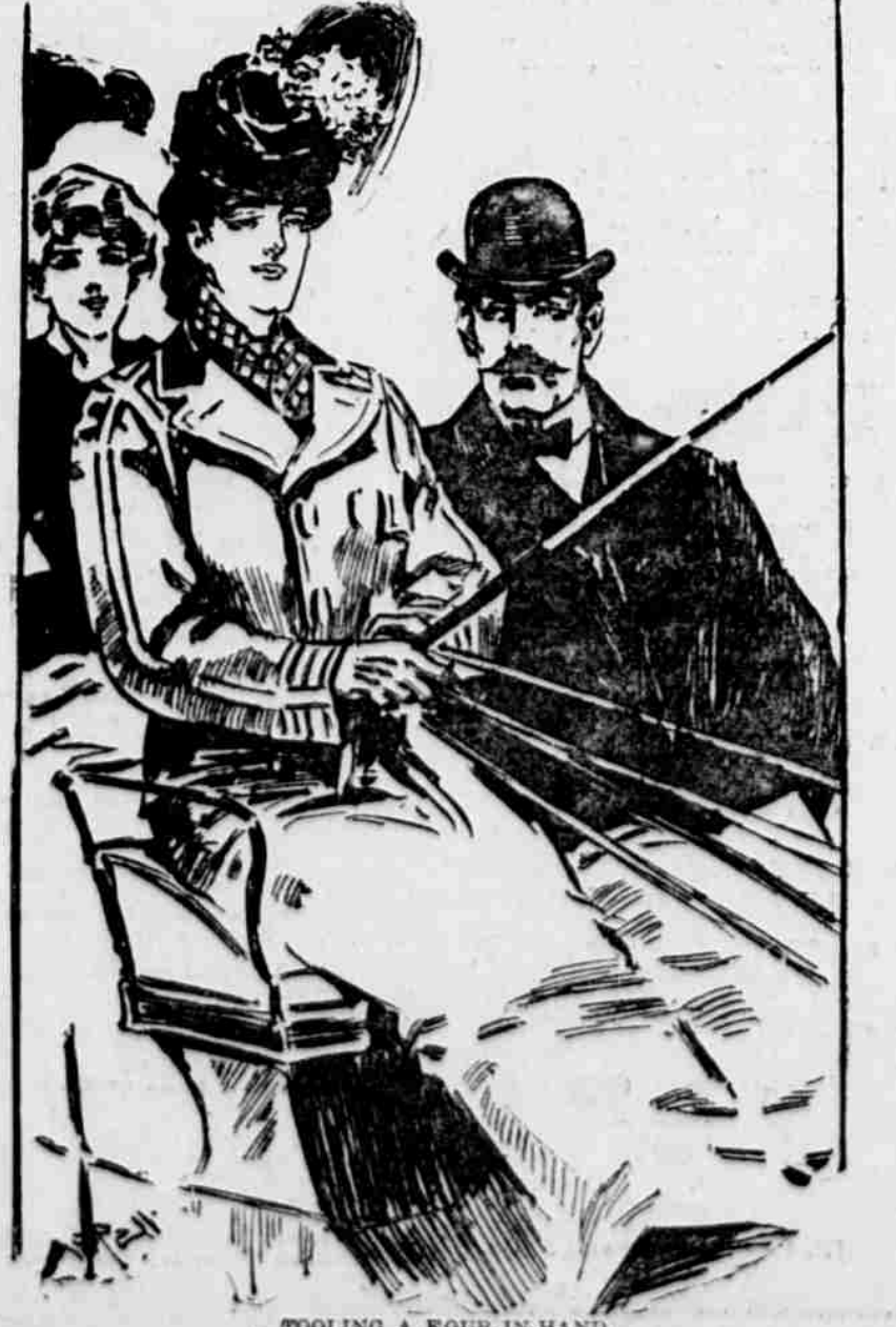
TOOLING A FOUR-IN-HAND.

sounds easily interpreted as sobs when his in the best circles. A wonderful fellow, men, working five days, to pack for shipment or storage the glass and china alone mistress is obliged to leave him at home. standing two feet high on his bare paws, of this wealthy lady, while a set of men This demonstration has been witnessed too with a coat as white as fresh fallen snow,