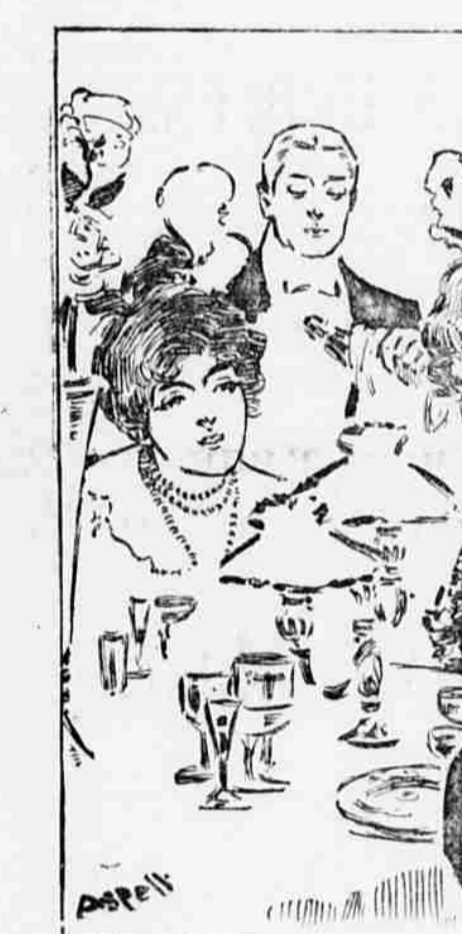
SUNDAY DINNERS OUT.