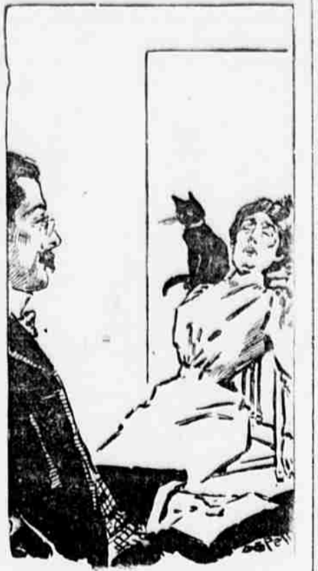
AN ORACLE OF MANHATTAN.