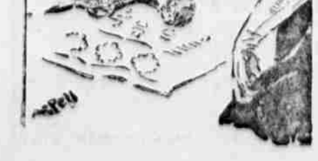
A LOUD ADVERTISEMENT.

It Brought Money into the Newspaper Man's Coffers. The former editor, who had retired from the brass department and gone into advertising exclusively, was telling his experiences to Washington Star man.