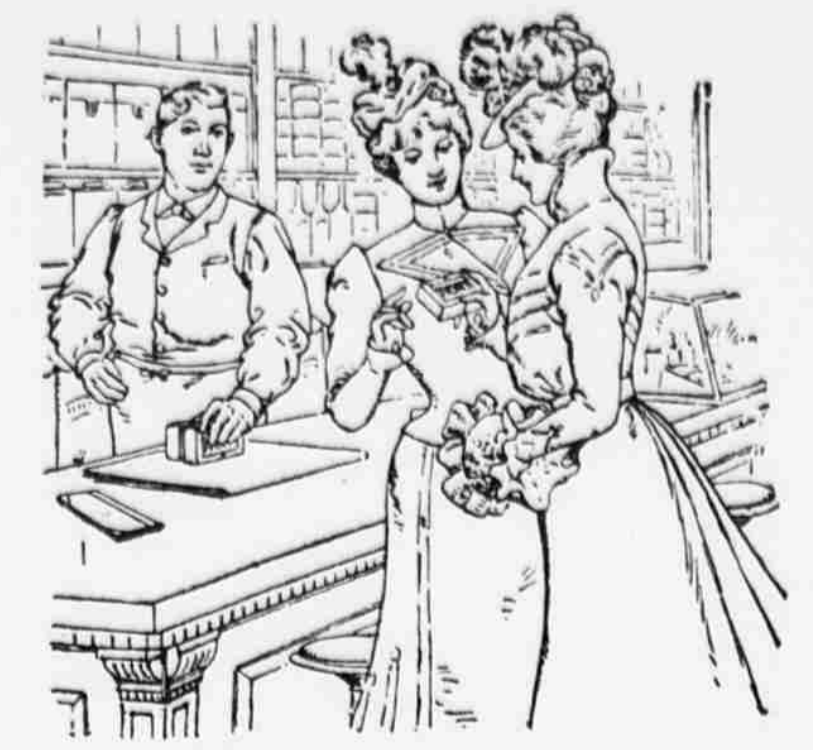
EXAMINE BEFORE YOU BUY.

The smallpox cloud, which, though small in size, has been hovering in a threatening manner over Omaha, seems to be clearing away.