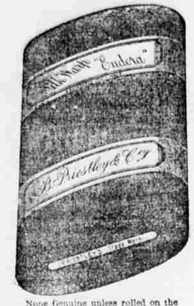
None Genuine unless rolled on the "VARNISHED BOARD," AND STAMPED EVERY FIVE YARDS WITH THE MANUFACTURERS' NAME.