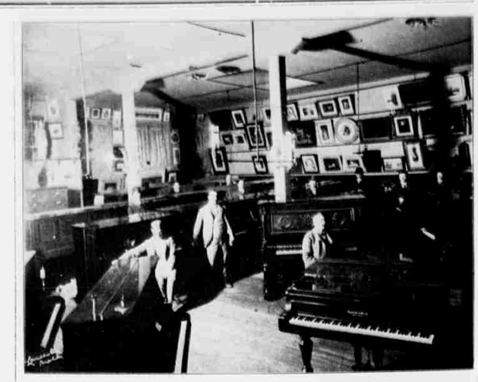
SECTION OF A. HOSPE WAREROOMS.

Eight-cent-"Troops Guarding Train," representing a detachment of United States In addition to the souvenir medals, of soldiers conveying an emigrant train across which a large quantity will be furnished the prairies, from a drawing by Frederick the government will also have a number of Remington, permission to use which was gold, bronze and silver medals struck off as awards to exhibitors under the rules adopted by the exposition management and printed on the back of each blank applicafrom a painting kindly loaned by the artist, tion that was sent out to the prospective exhibitors. These will bear appropriate emblems and inscriptions which will also be commemorative of the exposition and a series will be issued for each of the various Fifty-cent-"Western Mining Prospector," departments into which the exhibits are