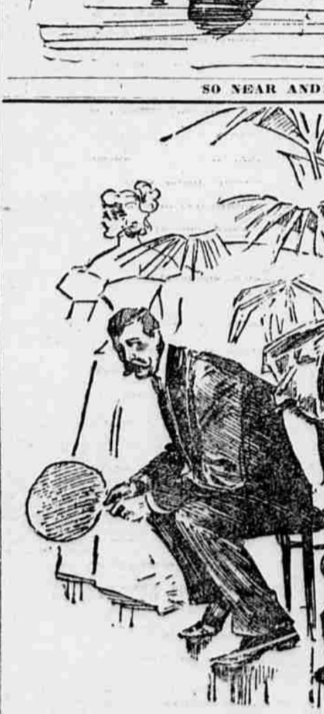
Lord Irrigate-You were at the theatre on Tuesday? Funny thing I didn't see you! She (coldly)-Not funny at all. I don't serve behind the bar!

MEAT BUSINESS EVIDENTLY.