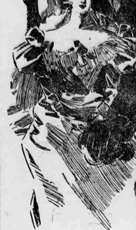
H-What an ugly man! I never saw anybody so ugly! She-Hush, dear! You forget yourself!

A MOST GENTLE REMINDER. From July. H-What an ugly man! I never saw anybody so ugly! She-Hush, dear! You forget yourself!