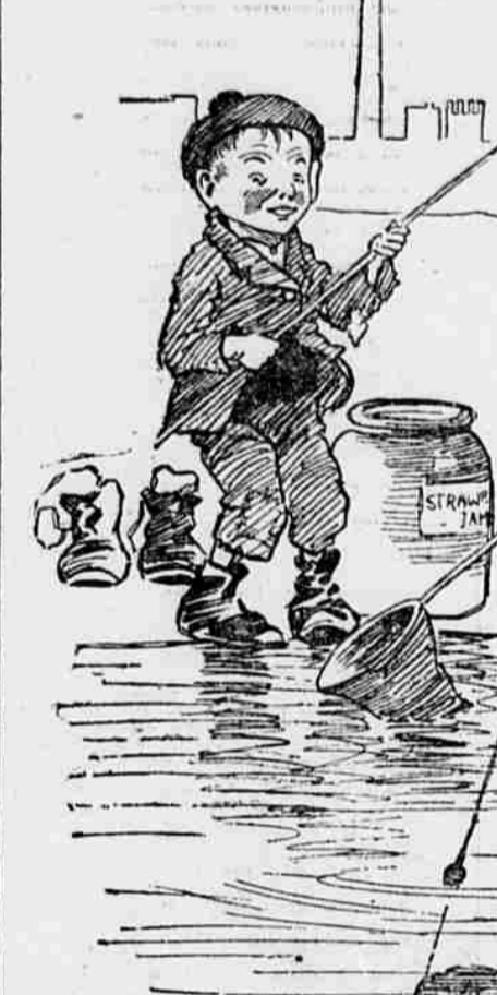
SO NEAR AND YET SO FAR.

THE GENTLE ART-"A BITE." From the Sketch.