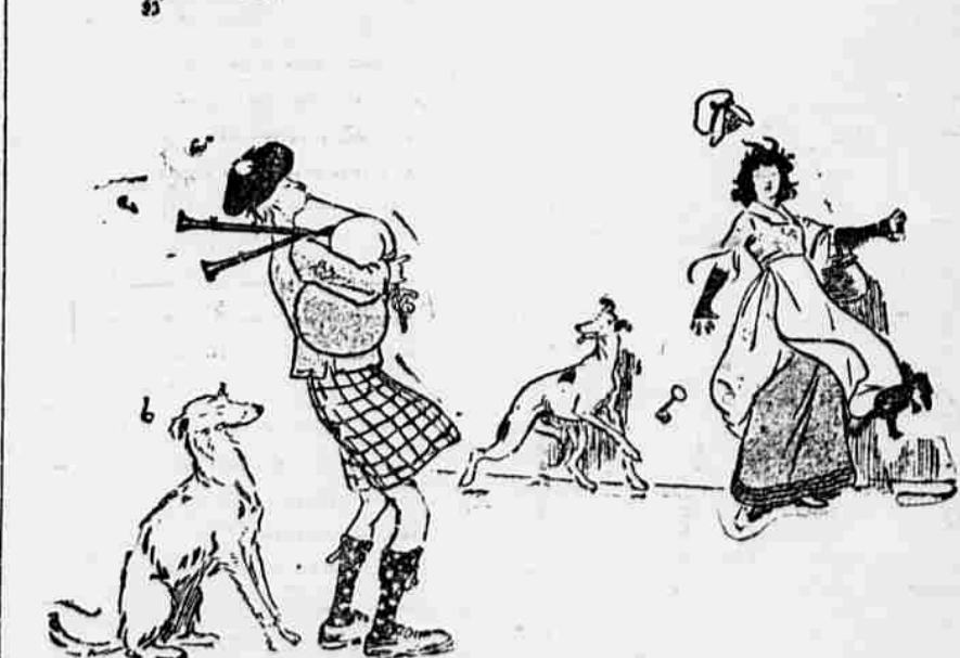
THE ART OF BEING COMPLIMENTARY. From Punch.