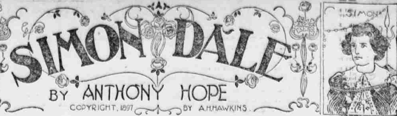
BY ANTHON HOPE COPYR. 1897 BY A. H. HAWKINS