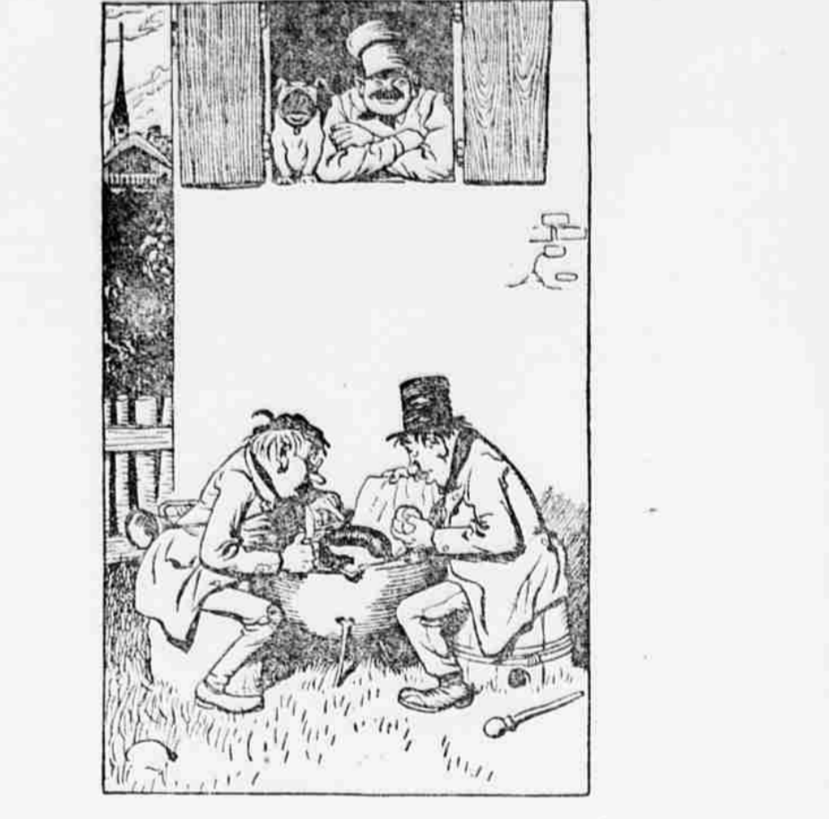
"This big sausage belongs to me."