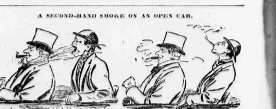
A SECOND-HAND SMOKE ON AN OPEN CAR.

(1) "Don't want to lose none o' this. (2) "Gosh! ain't there an aroney about it!"