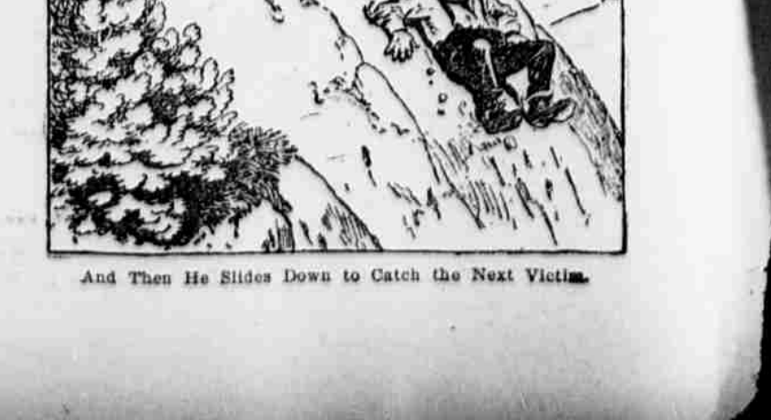
And Then He Slides Down to Catch the Next Victim.