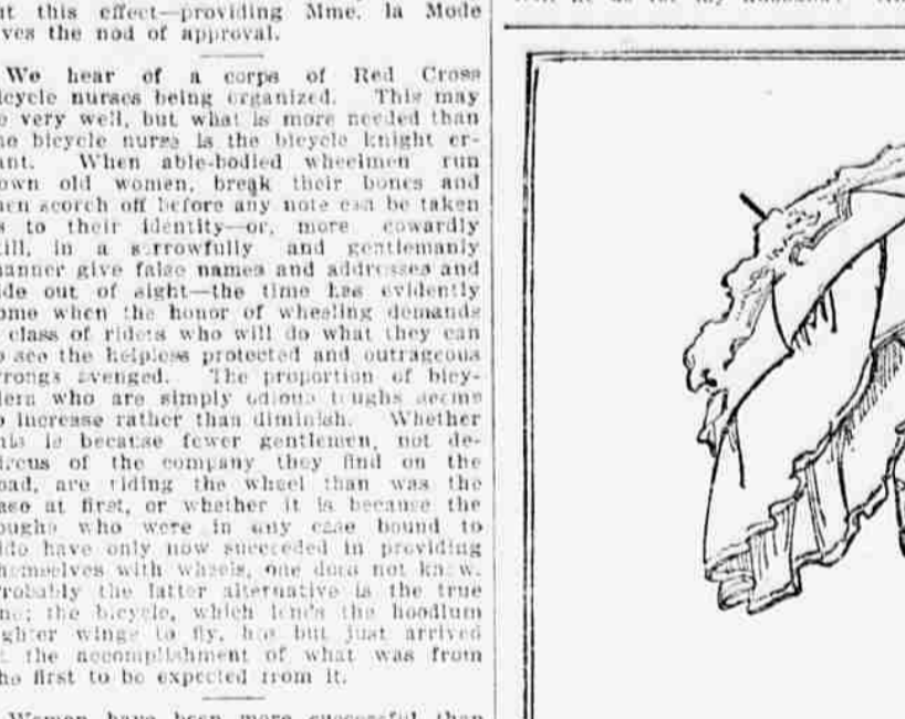
FLOWERED ORGANIE GOWN FROM HARPER'S BAZAR. One of the prettiest scenes for the eye to rest upon this summer is an outdoor gathering of young ladies dressed in flowered organdie gowns.