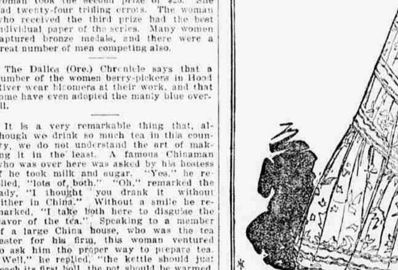
FLOWERED ORGANIE GOWN FROM HARPER'S BAZAR. One of the prettiest scenes for the eye to rest upon this summer is an outdoor gathering of young ladies dressed in flowered organdie gowns.

At least he cut falling straight from the knee rather than from the hip, as most skirts are cut. The following is the correct list of stones and the meanings they signify: