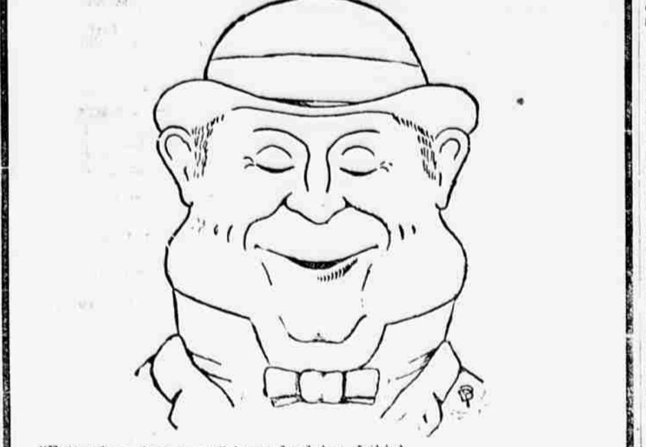
"Better late than never" is good advice, I think. For business men who've not begun the ink. -R. B. W.

At 6 o'clock on Sunday morning the guns were placed in position, and firing was begun. One gun was trained on each end of the bluff, and the firing was interrupted only to give the guns time to cool.