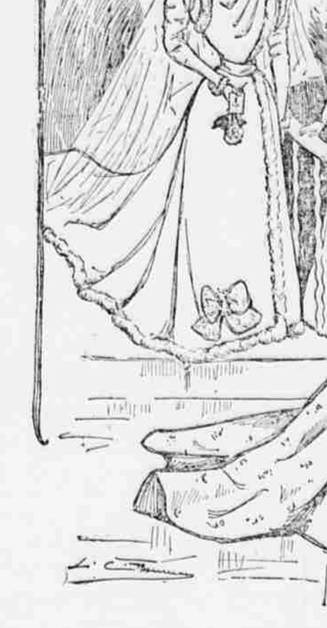
MODEL STOCKING CASES.

But Dr. Freund declares that "as practical garters are ornamented with the most fetching class of satin gird or Scotch plaid set in old silver."