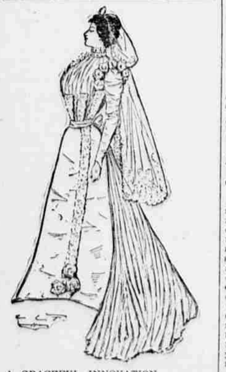
A GRACEFUL INNOVATION.

ELEGANT MODELS. The three remaining wedding frocks serve best to illustrate the three most popular materials of the new year.