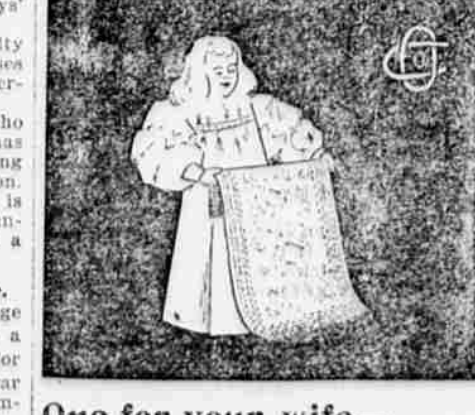
One for your wife-

We are making up rugs from fine carpetings for those who wish something especially nice for Christmas givingfrom an ordinary hearth rug to one big enough to cover the largest room in and forks for $2-some for more-better Omaha-your wife will appreciate one of course-child's silver plated knife, fork of these more than almost anything you and spoon 25c-and lots of useful little can give her-while the cost to you is things that make appreciable Christmas