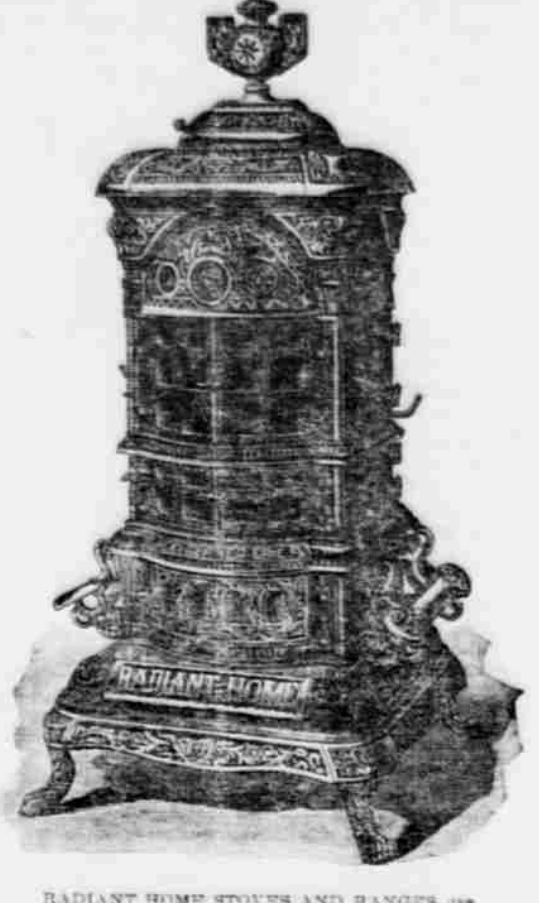
RADIANT HOME STOVES AND RANGES use less coal and give more heat than any other. Prices from 121.00 up.