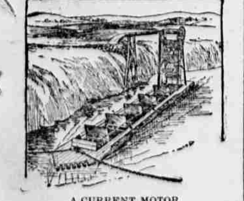
A CURRENT MOTOR.

Several electrical farms exist at the present time, but they are merely instances of special application; the broader application remains to be accomplished. There is, however, no reason why we should not possess a comprehensive electric farm at once. Not only have we a host of mechanical devices such as electric plows, harrows and other soil disturbers, but the fact that the current can be used in lieu of the regulation forcing frame is a possibility in itself of vast importance. Nearly every department of the farm has suggested an idea to the electrical