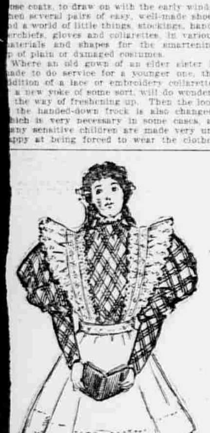
BLUE WOOL FROCK.