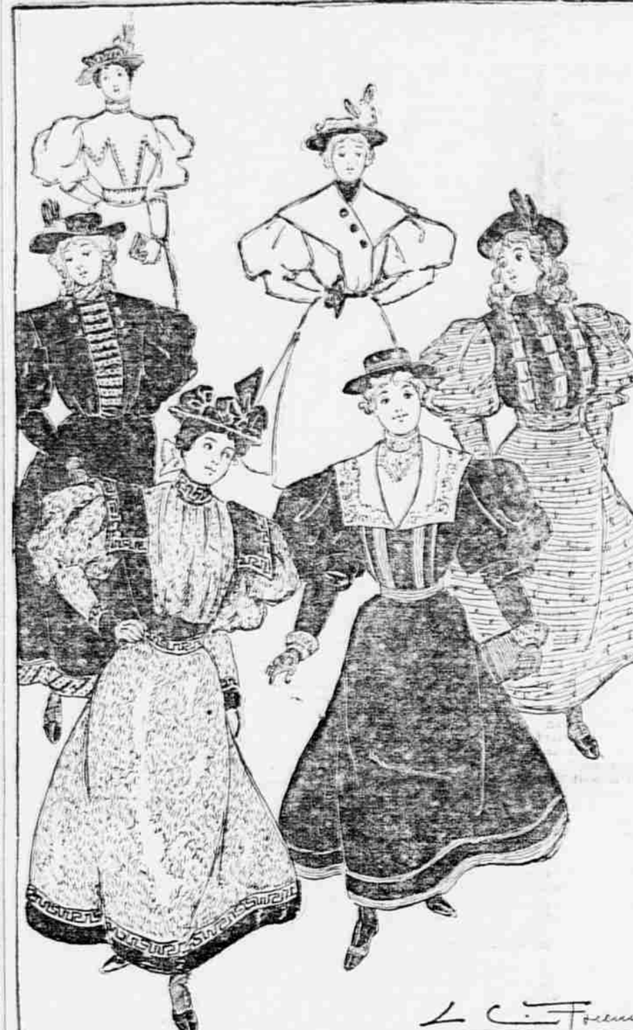
SCHOOL GOWNS FOR AUTUMN.