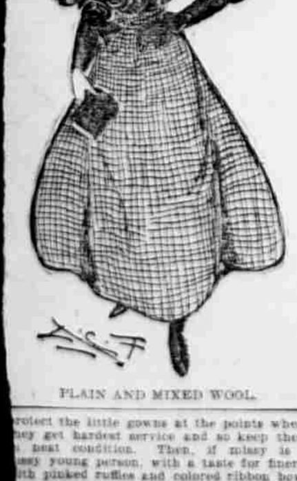
PLAIN AND MIXED WOOL.