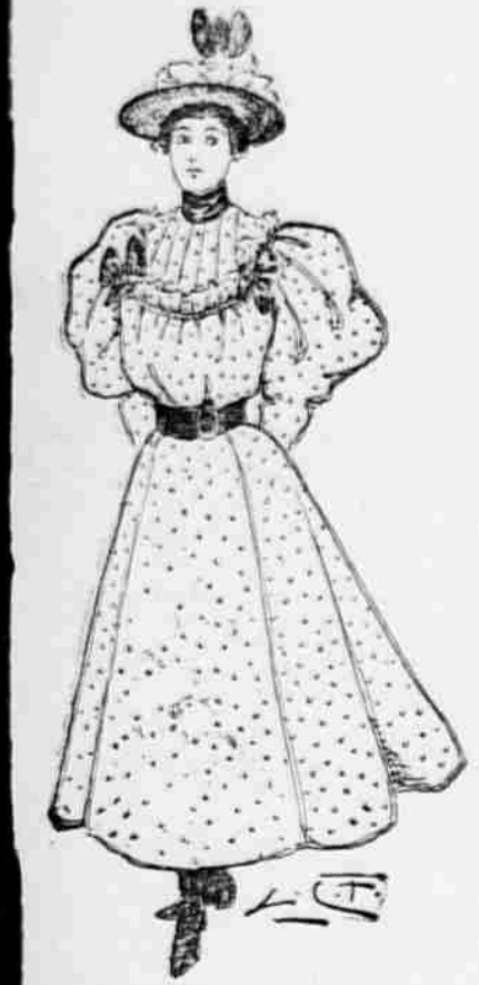
BROWN NOVELTY WOOL.

Bachelor buttons are attaching to a favorite place on tea and tray cloths. They are embroidered in the nature of shades, in kebab-stitch with shell-stitch.