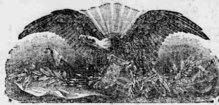
To Show the Immense Power of the Boston Store and What It Can Do.

Boston Store will hold tomorrow a SUPREME CHALLENGE SALE, Open to all the world. Boston Store defies any or all to hold a sale like it. New goods, fresh goods, stylish goods; goods bought within twenty days from headquarters. Good goods of every kind and description under the sun will be sold at prices that present times have made impossible to any other house in the state. It will be a challenge sale that will make all other sales ridiculous and insignificant, by comparison.