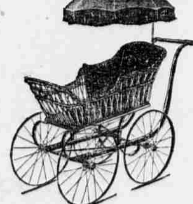
Made of cane, the best possible springs and gear, upholstered as seen in cut, everything first class, price $4.25.