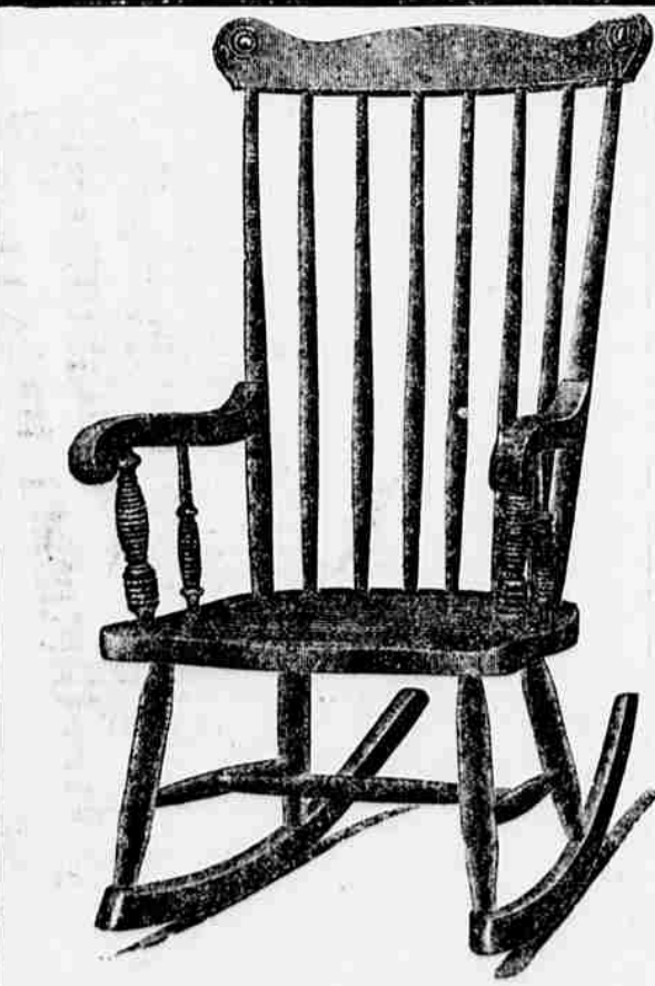
Large Oak Rocker, $2.65.

A beautiful rocker, latest style, antique polish finish, full size, thoroughly well made and cheap at double the money. This is only one of the many bargains we have to offer. Mail orders received Monday and Tuesday only will be filled.