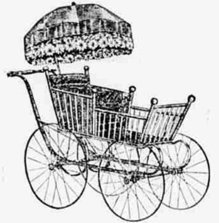
FEATHERSTONE BABY CARRIAGES.

We carry the largest line of Refrigerators and Ice Chests in the city. Also a complete stock of Ice Cream Freezers, Coolers, etc.