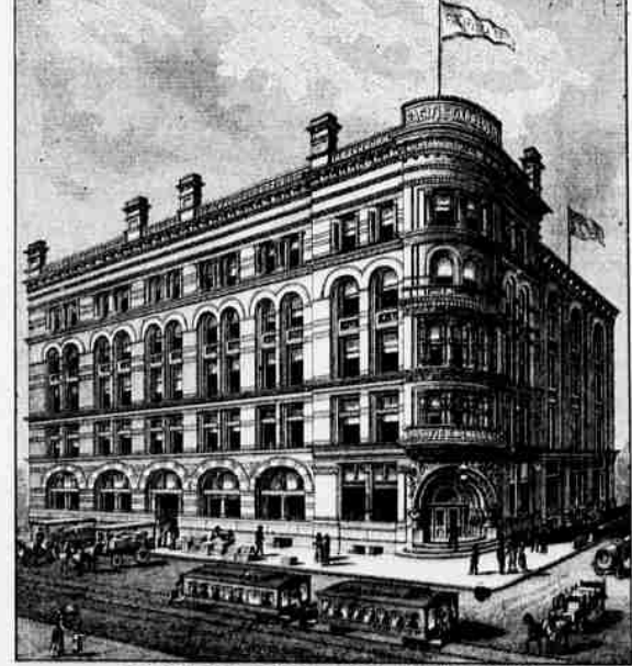
PACIFIC EXPRESS BUILDING. ERECTED 1889.