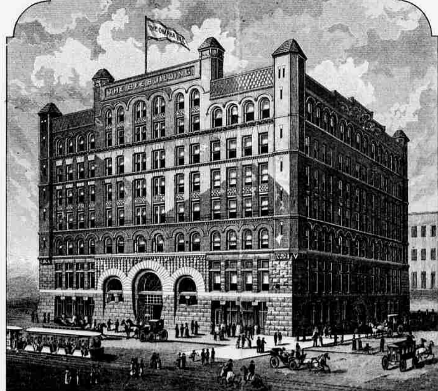
THE BEE BUILDING. ERECTED 1889.