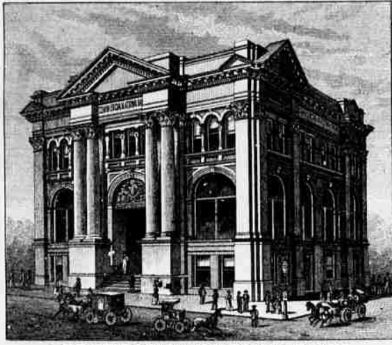
COMMERCIAL NATIONAL BANK. ERECTED 1889.