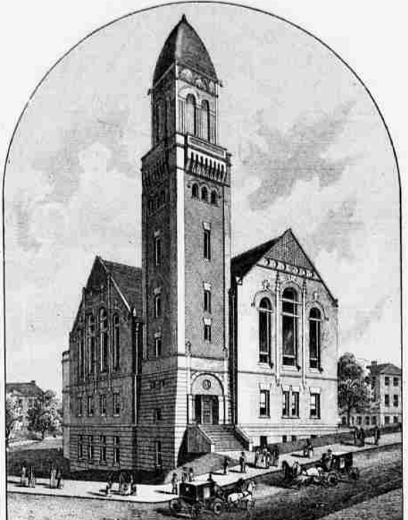
1 ST METHODIST CHURCH. ERECTED 1889.