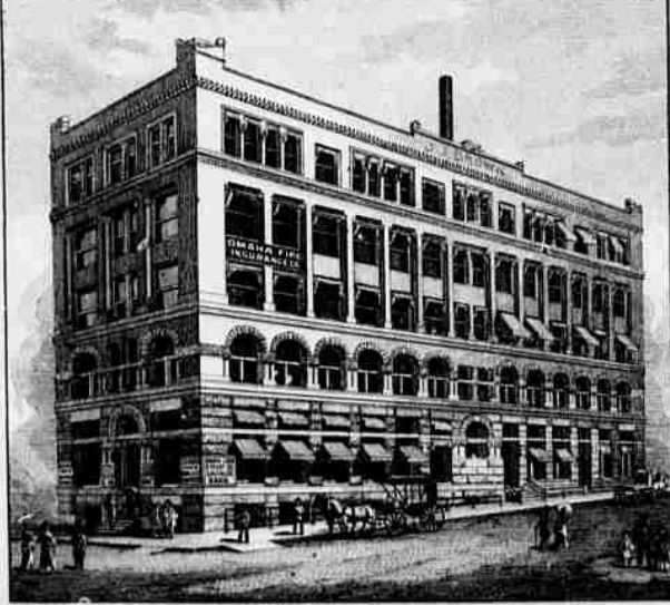
J. J. BROWN BLOCK. ERECTED 1889.