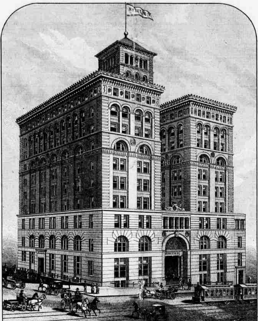
THE NEW YORK LIFE INSURANCE COMPANY BUILDING. ERECTED 1889.