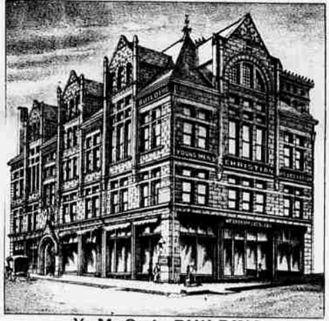
Y. M. C. A. BUILDING. ERECTED 1889.