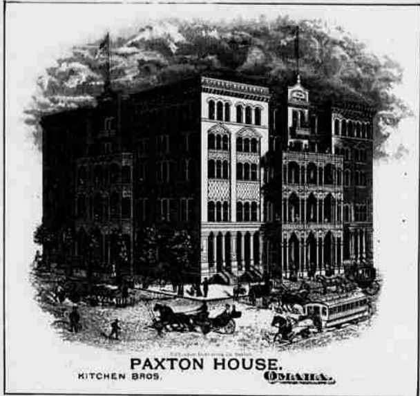
PAXTON HOUSE. KITCHEN BROS. OMAHA.