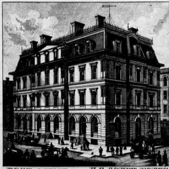
POST OFFICE AND U.S. COURT HOUSE.