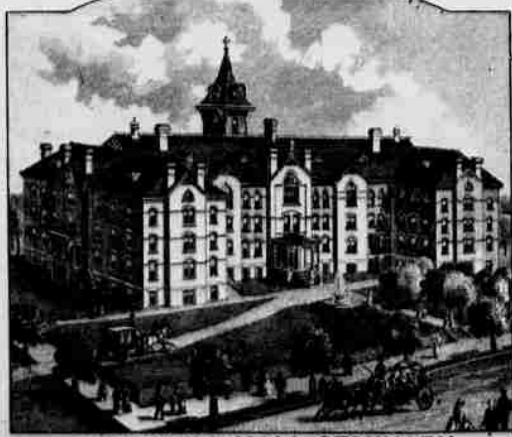
BROWNELL HALL SEMINARY.