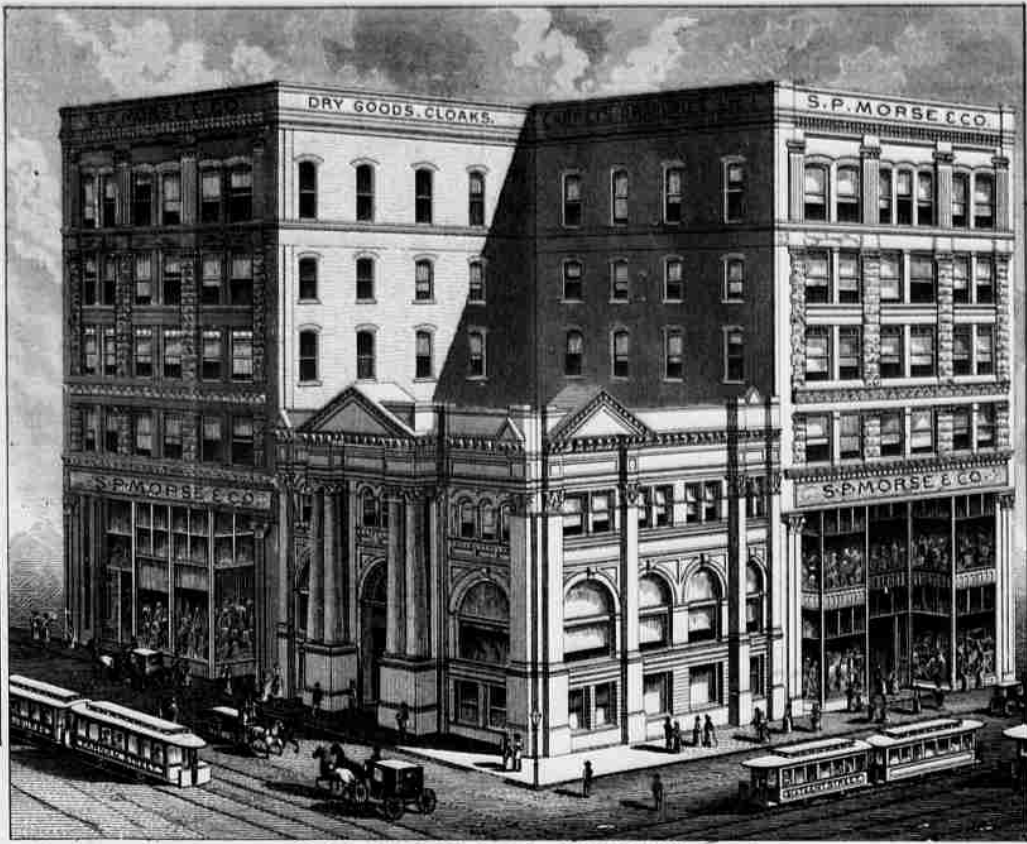
S. P. MORSE & CO. BUILDING. ERECTED 1889.