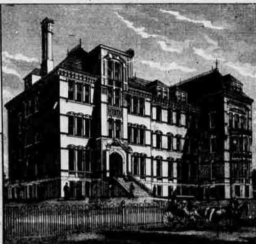
SACRED HEART CONVENT.