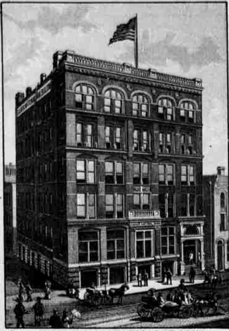
OMAHA NATIONAL BANK.