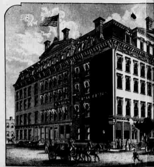
UNION PACIFIC RAILWAY CO'S HEADQUARTERS.