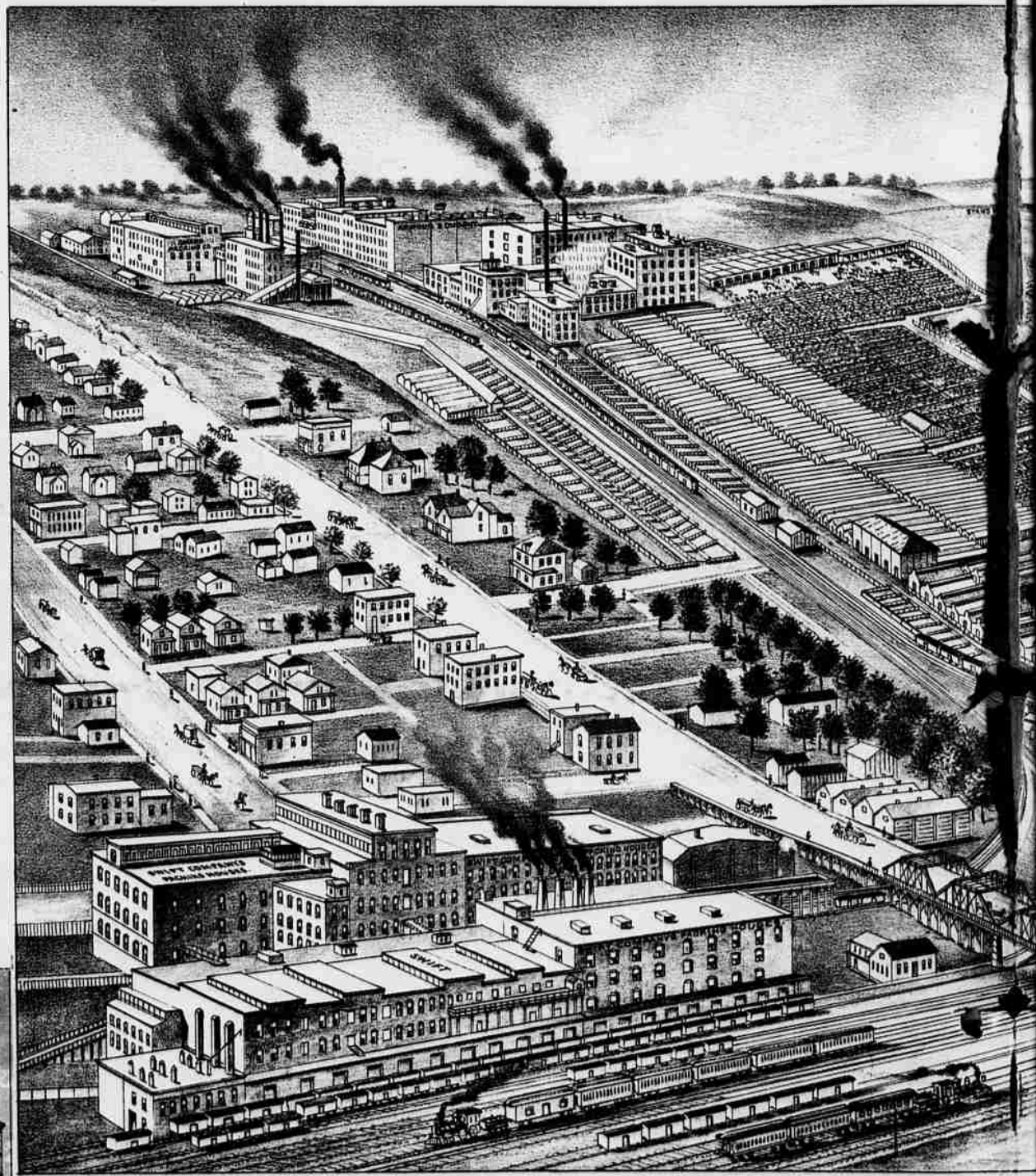
UNION STOCK YARDS, PACKING HOUSES & STOCK PENS.