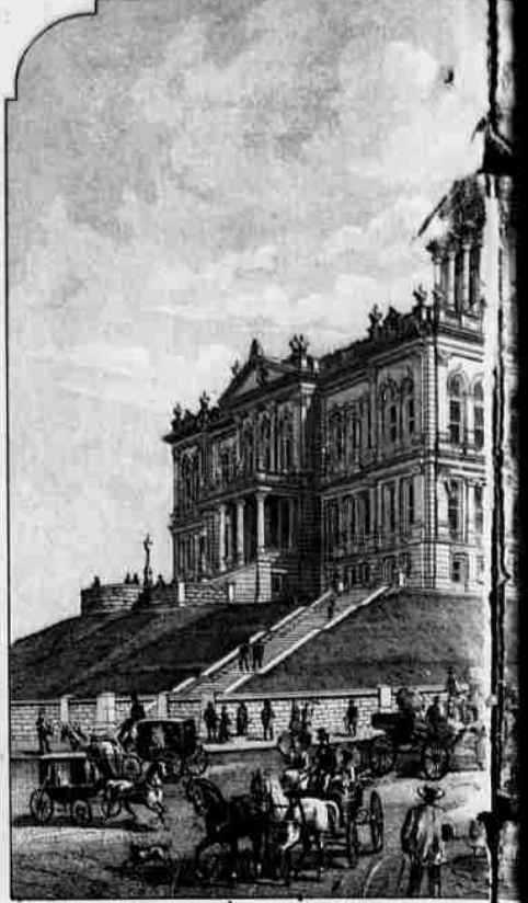
DOUGLAS COUNTY COURTHOUSE.