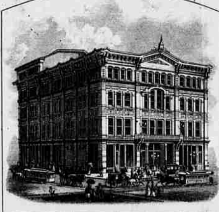
THE BOYD OPERA HOUSE.