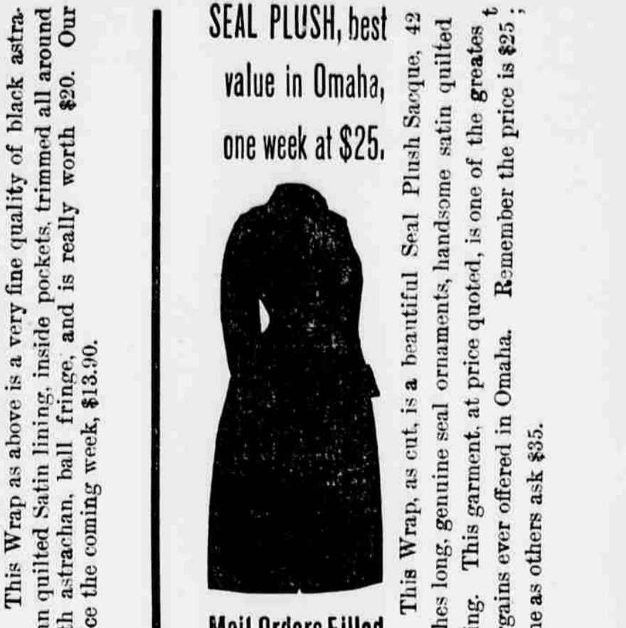
SEAL PLUSH, best value in Omaha, one week at $25. This Wrap, as cut, is a beautiful Seal Plush Safoque, 42 inches long, genuine seal ornaments, handsome satin quilted lining. This garment, at price quoted, is one of the greatest bargains ever offered in Omaha. Remember the price is $25, same as others ask $35. Mail Orders Filled

Monday we will offer 100 Children's Brown Mixed Cheviot Cloaks, with Havelock Cape, ages 4 to 10 years, all at one price Monday, $1.48 each. 50 Misses' Newmarkets, with Shoulder Cape, an elegant brown mixed cloth, in ages 12, 14 and 16 years, all at one price Monday, $4.88 each. These garments are really worth $7.50.