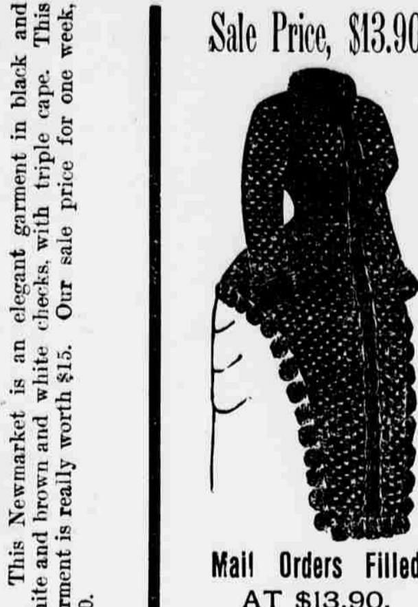
Sale Price, $13.90 This Wrap as above is a very fine quality of black astrachan quilted Satin lining, inside pockets, trimmed all around with astrachan, ball fringe, and is really worth $20. Our price the coming week, $13.90. Mail Orders Filled AT $13.90.