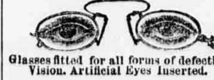
Glasses fitted for all forms of defective Vision. Artificial Eyes inserted.

1508 FARNAM ST. Practice limited to Diseases of the EYE, EAR, NOSE and THROAT.